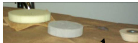
Sanding pad parts

Fred turns the bowls green, lets them dry for 3 days, sands then adds the finish. He likes an egg or parable shape for the bottoms (lessens the cracking when drying) and open bowl shape as it's easier to sand. Fred likes to cut face grain as much as possible. By wiggling the tool a bit you can find the sweet cutting spot. Fred finishes the outside to final shape then hogs out the middle to half the final depth. [continued page 2]