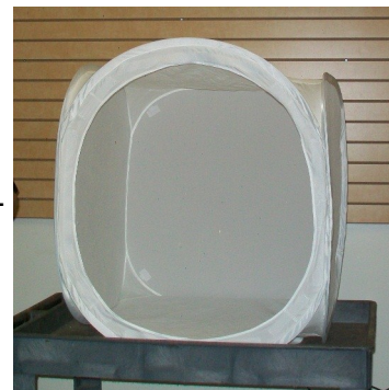
Clubs Light box

W ith a light box, multiple lights and a simple digital camera you can take very good photos of your turnings. First, white balance your camera and don't mix light sources. Different sources emit different colors (incandescent-red, heavy shade-blue). Second, take notes on exposure, focus & composition. Toss the bad ones, correct the problems & retake. Resolution rule of thumb: 1.5