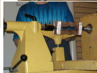
Challenge for May: Multi axis/Split turning