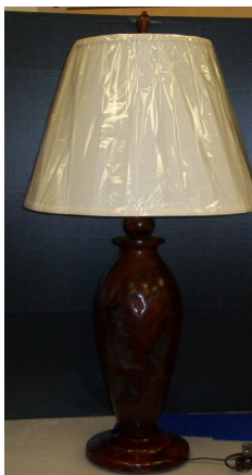
Wood: Apple, maple, white oak, elm, cherry, walnut, Mahanoy, bub- inga, red heart, red euphuist.