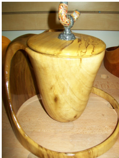
Bad things happen