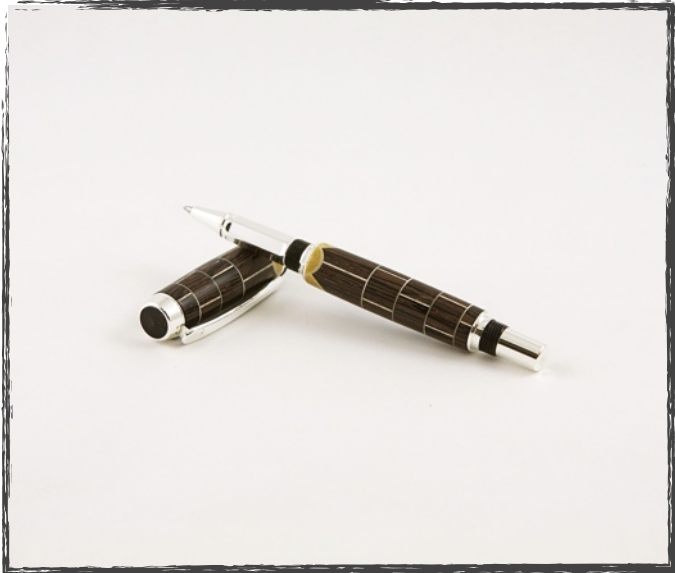
Jim Zorn Pen