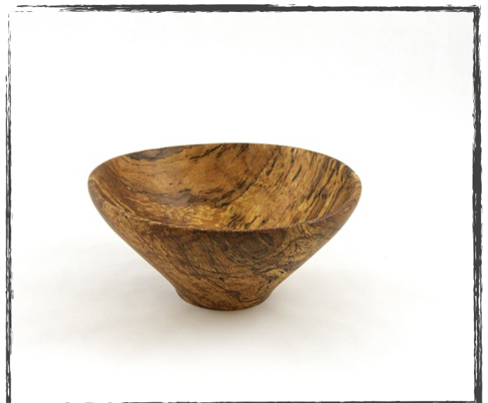
Chuck Mosser Oak burl