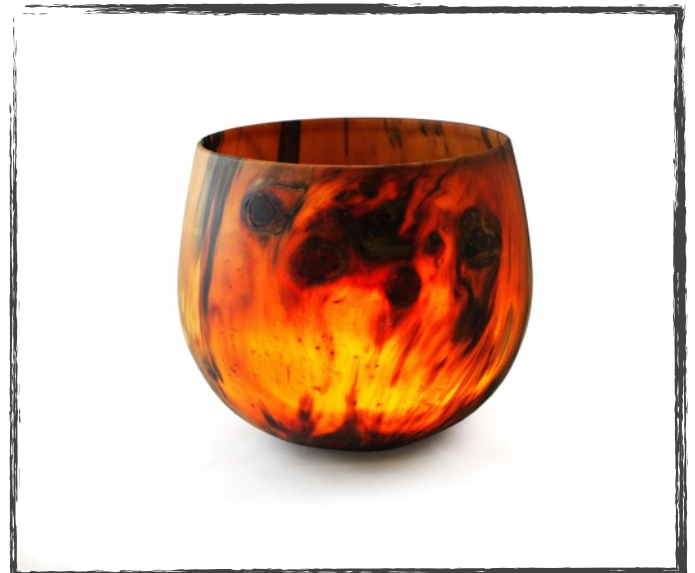
Jim Bumpas Norfolk Island Pine Soaked in boiled linseed oil, to be finished with poly