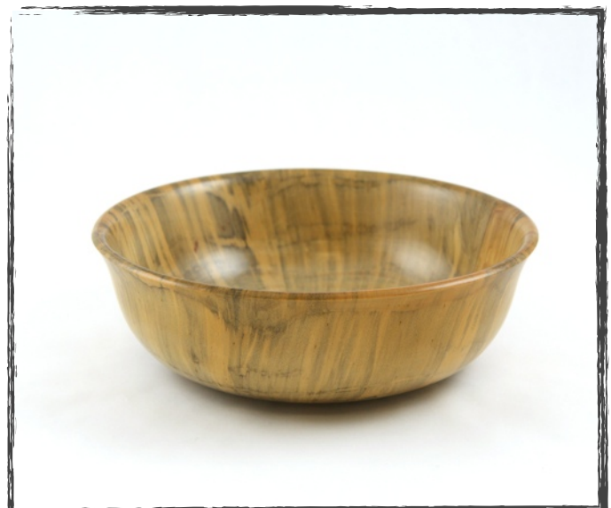
Dan Luttrell Norfolk Island Pine