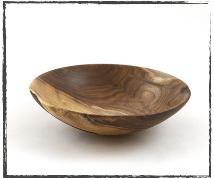
Bob Silkenson Walnut