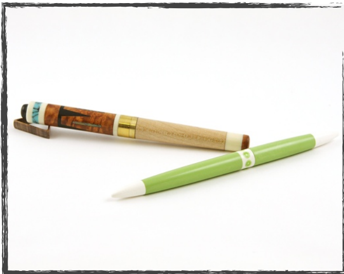
Bruce Robbins Pool Cue Pen Keylime Pie Pen