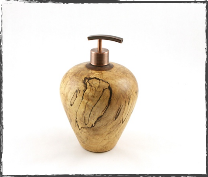
Ray Melton Spalted Maple soap/lotion dispenser