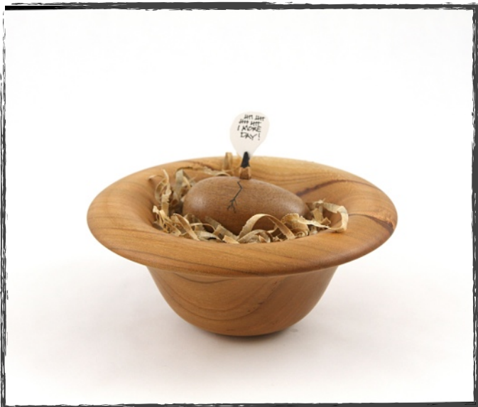
Cherry Bowl with mahogany egg