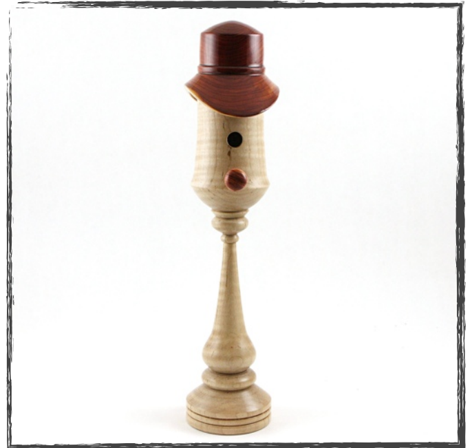
Deane Cox Curly maple & Cedar