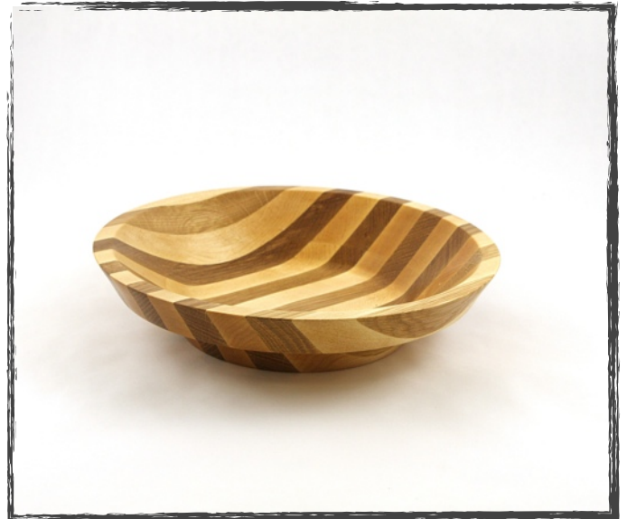
Rollie Oak & Maple