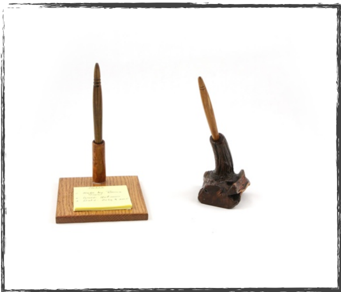
Bonnie Cross Pen with stand