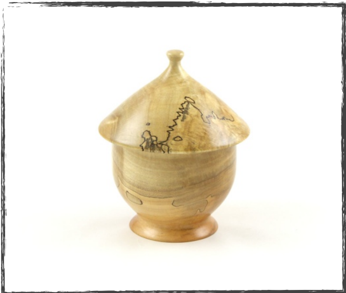
Chuck Mosser Maple Burl