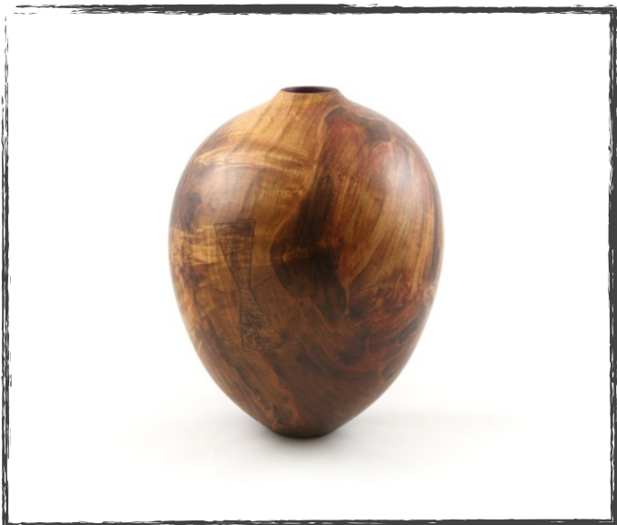
Jim Bumpas Hollow-form with butterfly patch