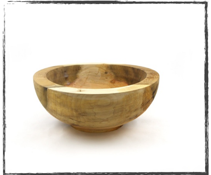
Chuck Horton WIP poplar bowl