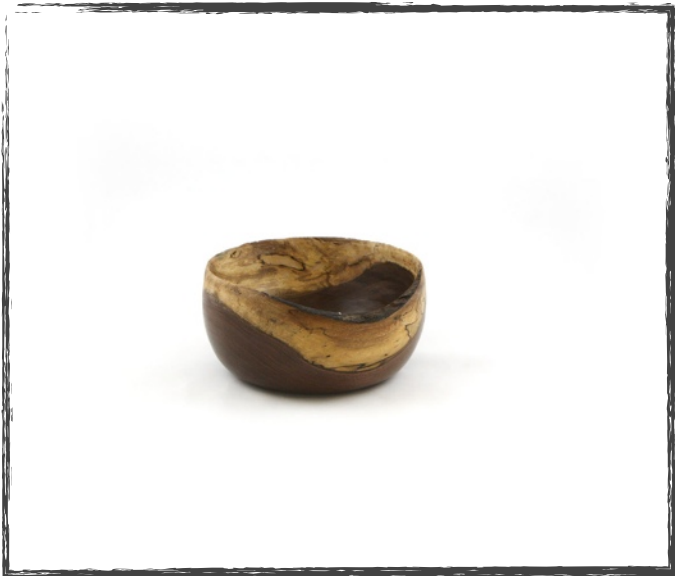
Rob Balder Walnut bowl