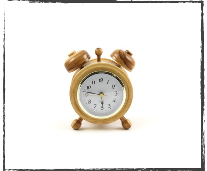
Rollie Hickory Clock