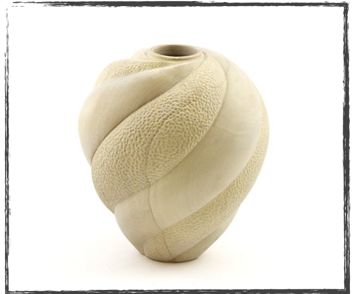
Jim Bumpas Carved and Textured Hollow Form