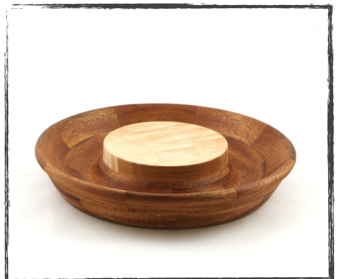
Jim Zorn Cheese & Cracker Tray (Mahogany & Maple)