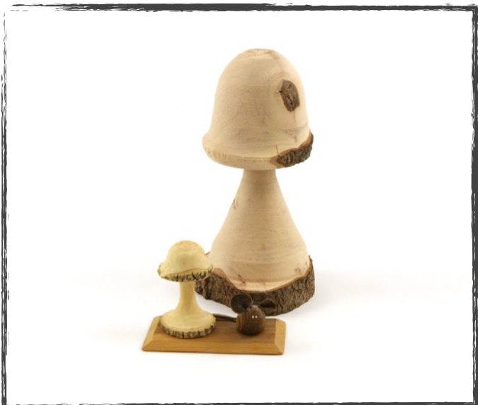
David Gray Large and small mushroom (Dogwood) Mouse (Fir)