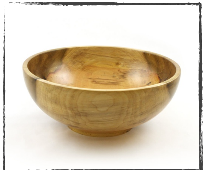
Chuck Horton Spalted Tulip Poplar