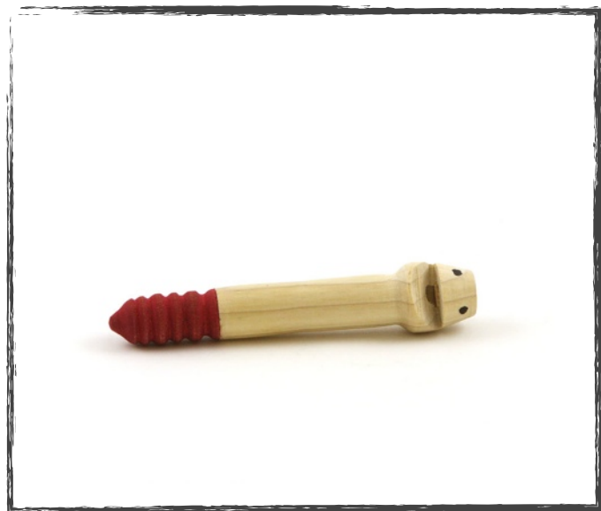
Snake Whistle w/ rattle