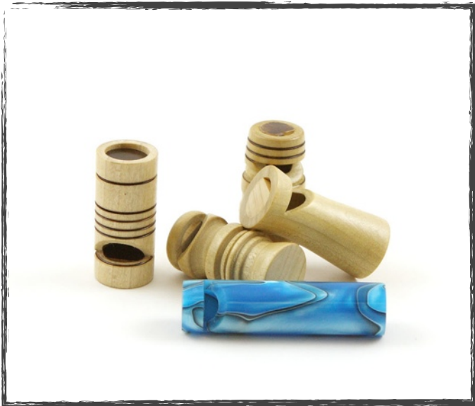
Chuck Bajnai Whistles