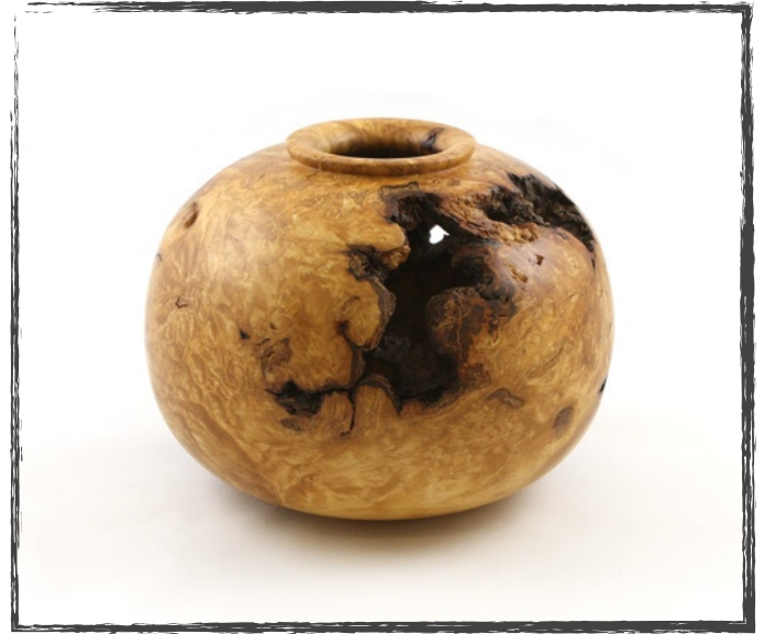
Maple Burl (Lake Placid)