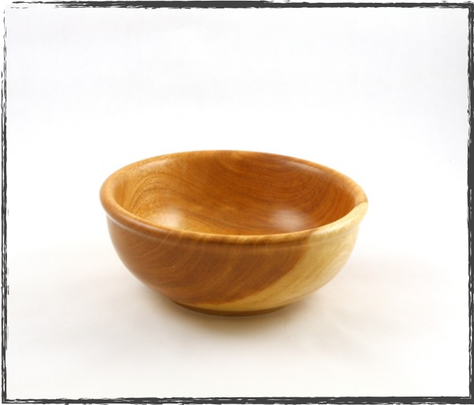
Chuck Horten Cuban Mahogany