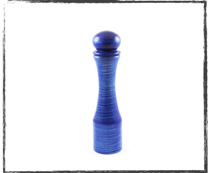
Ray Melton Curly Maple with blue dye