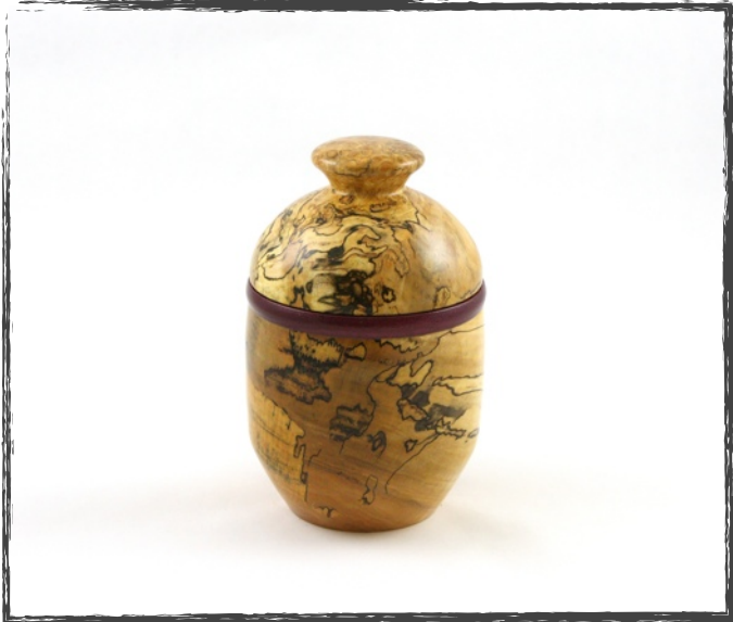
Chuck Mosser Spalted Maple Burl & Purpleheart