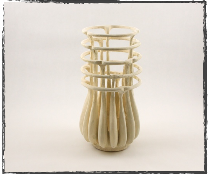
Jim Bumpas Holly "Tree" in progress