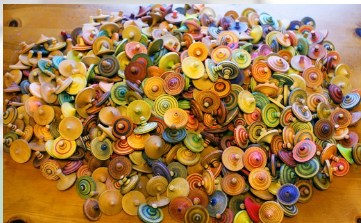
Rollie turned in an impressive 622 Tops