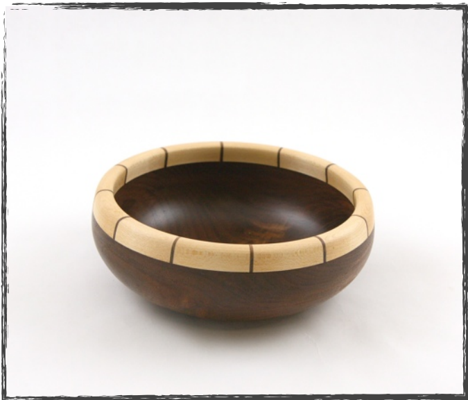
Bill Buchanan Maple & Walnut