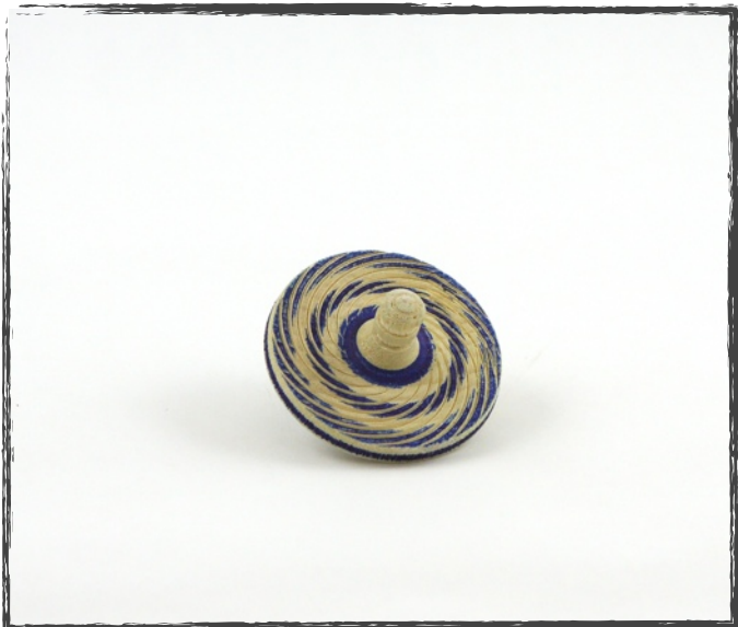
Rollie Poplar Spinning Top