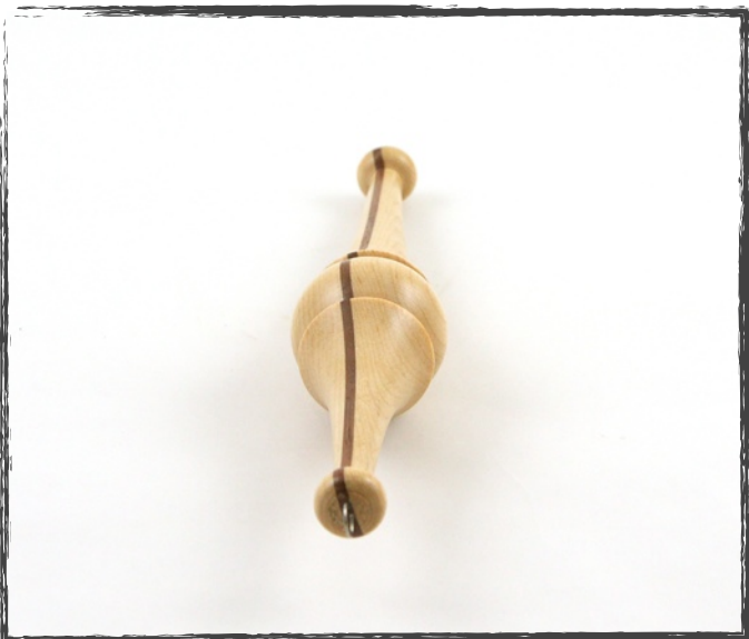
Mac Derry Maple & Walnut