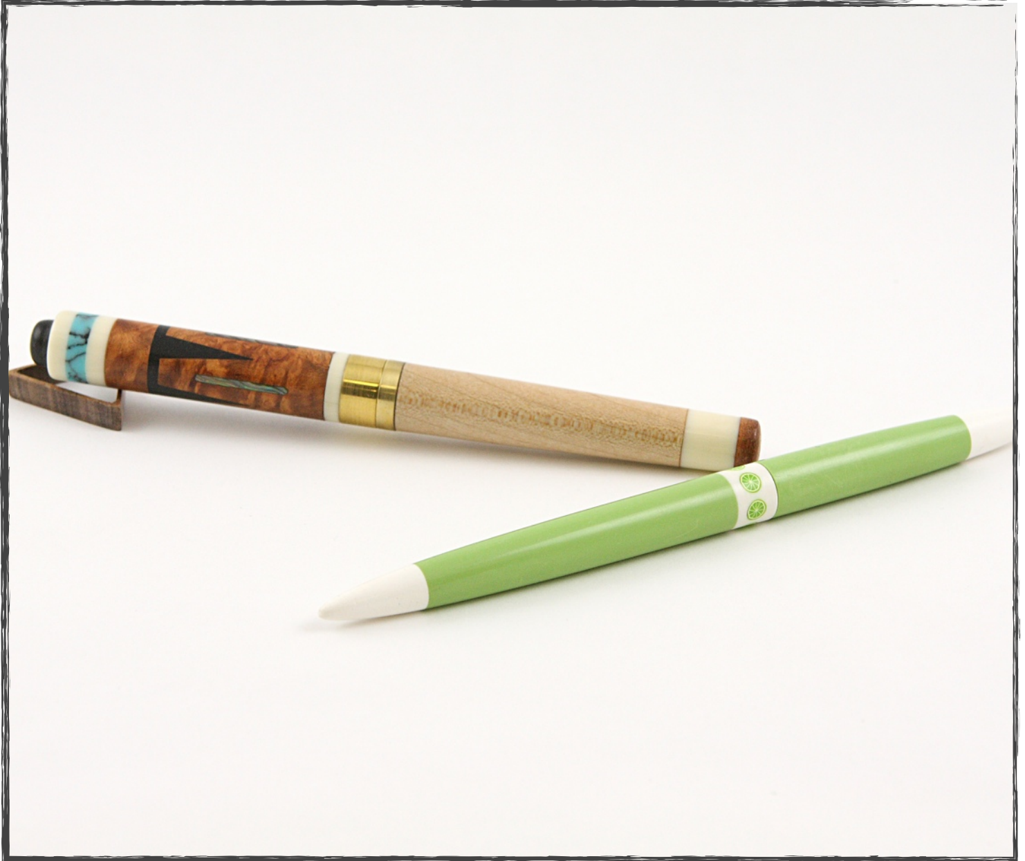
Bruce Robbins Pool Cue Pen Keylime Pie Pen