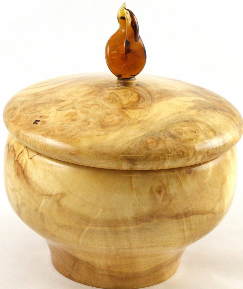
Chuck Moser Maple Burl & Glass