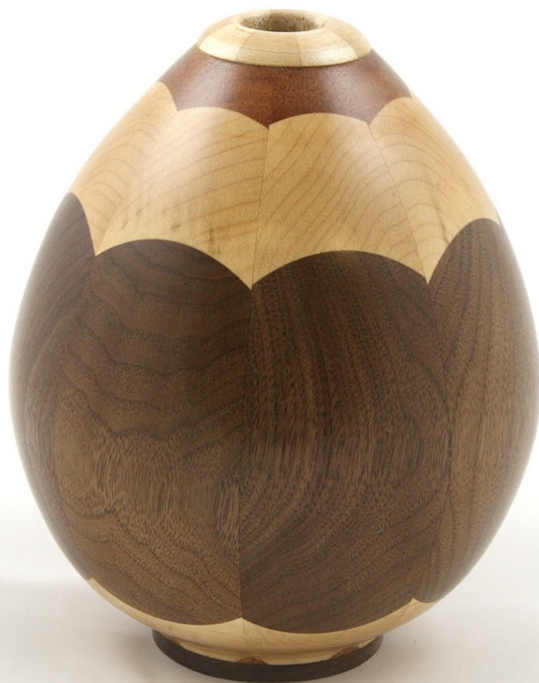
Jim Zorn Maple & Walnut Vase