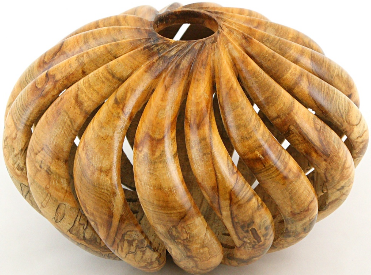
Jim Bumpas Maple Hollow form Carved Spirals