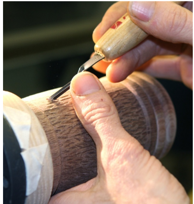
Matt demonstrated texturing a walnut box with a small hand gouge. Using a 2mm U-shaped gouge, small grooves were carved into a thatch-like pattern.