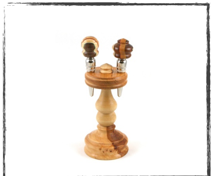
Jerry Fisher Cherry/Maple & Laminated Woods