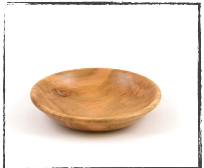
Jim O'hanlon Apple