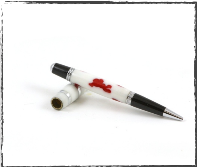
Jim Zorn Valentine's Day Pen