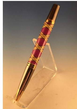
Single color background with box pattern on top

Richmond Penturners meet at 6:30 on the second Thursday of odd months at Richmond Woodcraft