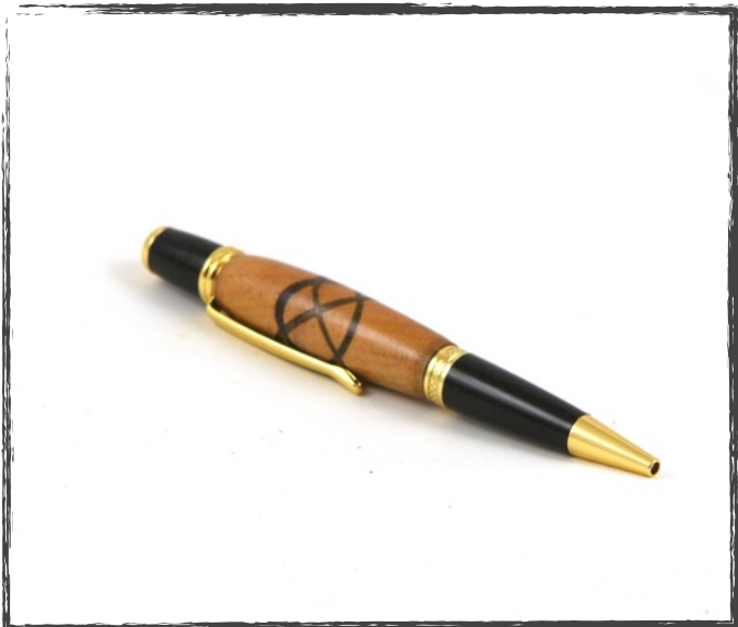
Rob Blader Cherry/Walnut