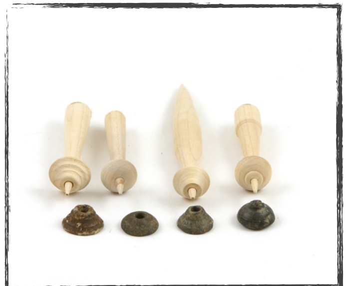
Meg Shogren Spindle Whorl Sandcasting Molds