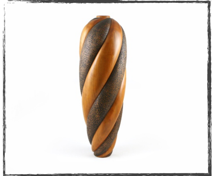
Jim Bumpas 21" tall x 6" w Cherry