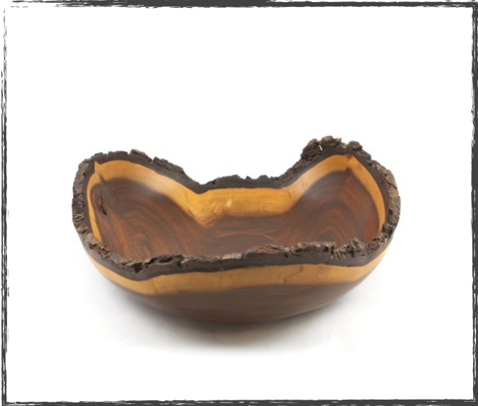
Steve Clement Walnut Natural Edge