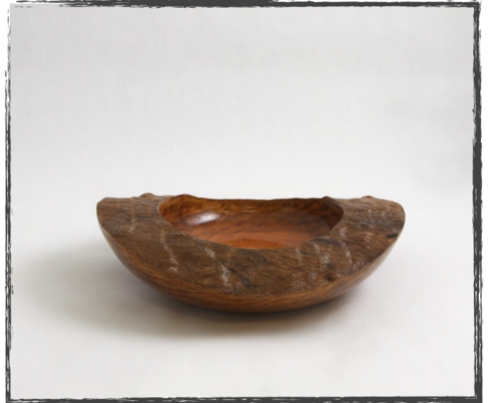
Chuck Mosser Red Eucalyptus Lacquer finish