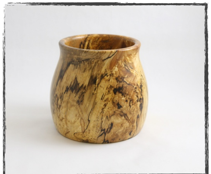
Dick Webb Spalted River Birch BLO, Shellac, Alcohol