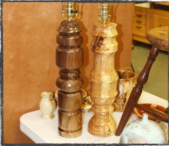
Terry Moore Maple & Walnut