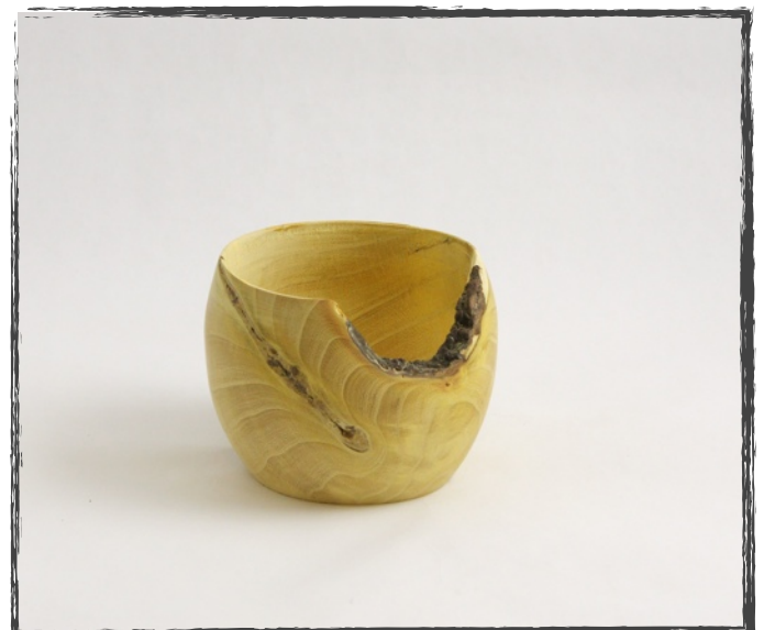
Wally Ubik Mulberry Forestry Project