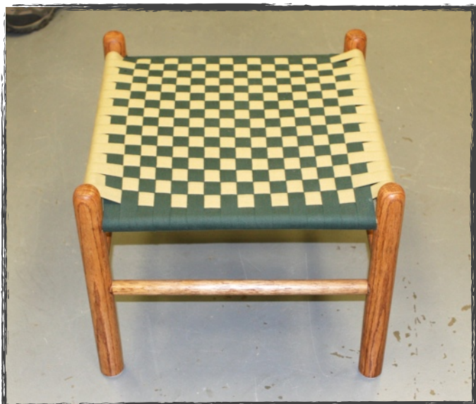
Gordon Kendrick Red Oak & Hickory Spray Shellac