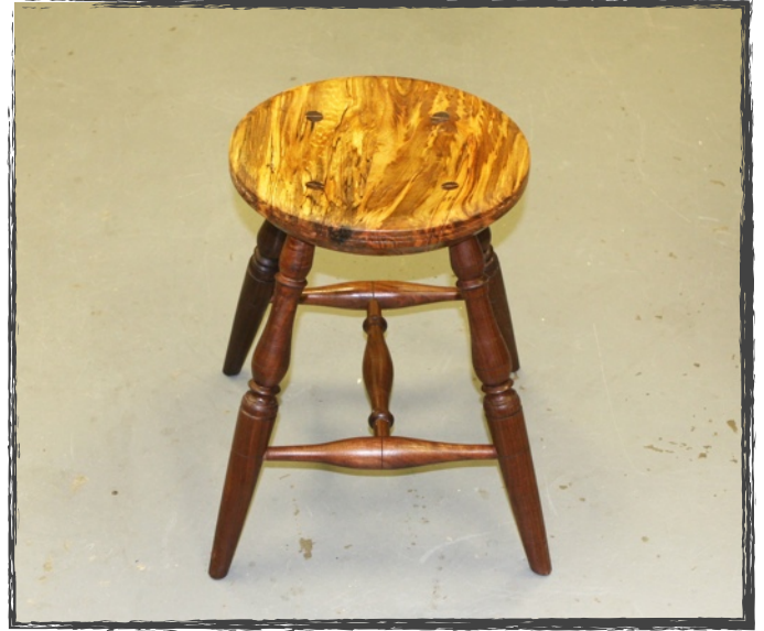
Bill Jenkins Walnut Legs & Ambrosia Maple Top