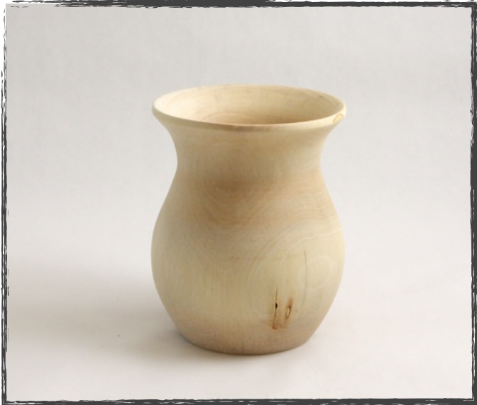
Wally Ubik Sycamore Forestry Project