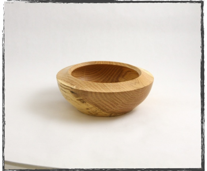
Cody Walker Oak