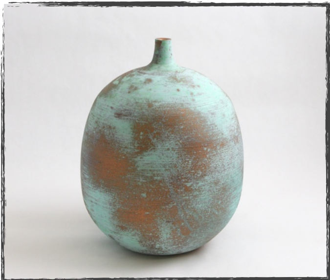
Dick Hines Birch Metal Effects