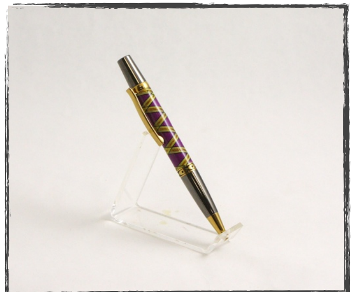
Bruce Robbins Thread Weave Epoxy