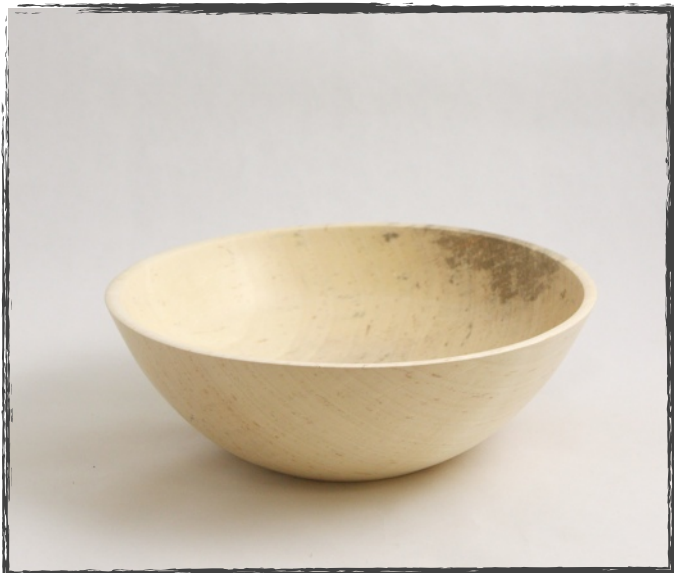
Wally Ubik Maple (first bowl)