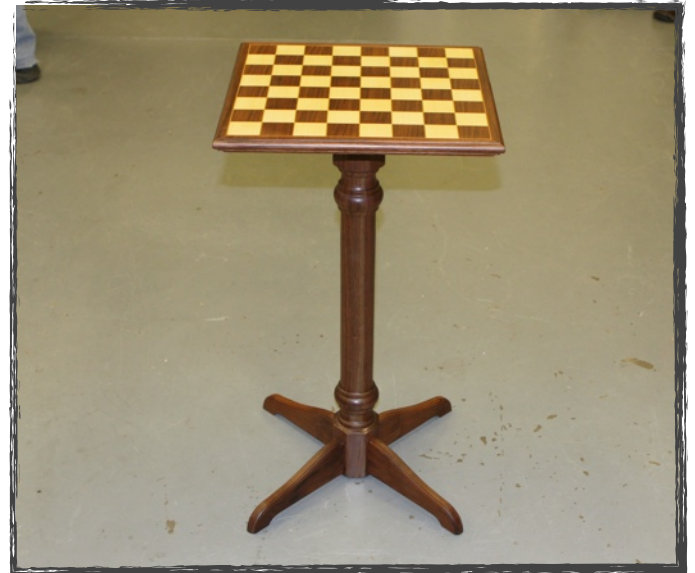
Doug Murray Walnut and Maple Poly