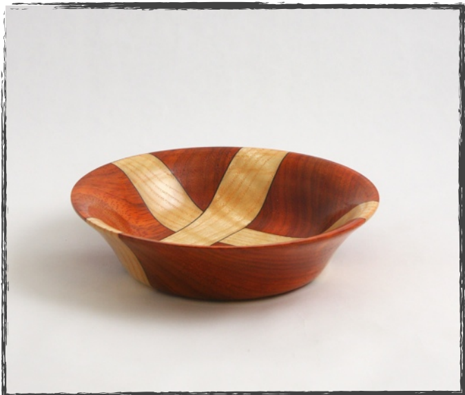
Royal Wood Paduak & Hickory Shellac