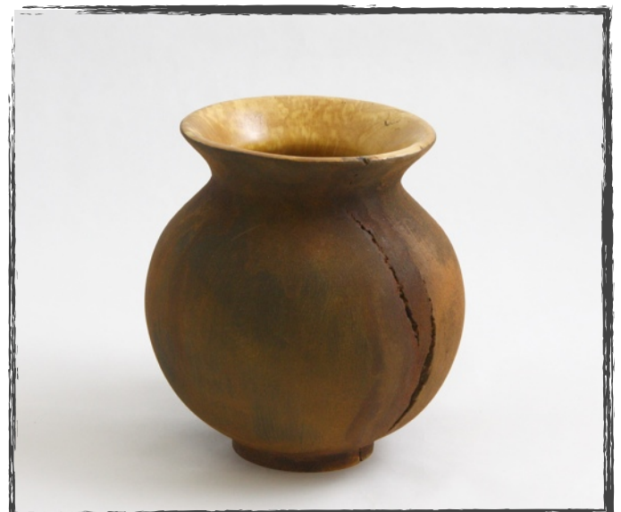
Dick Hines Birch Metal Effects