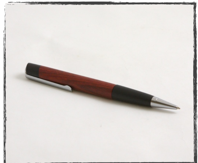
Jim Zorn Bloodwood/Ebony EEE