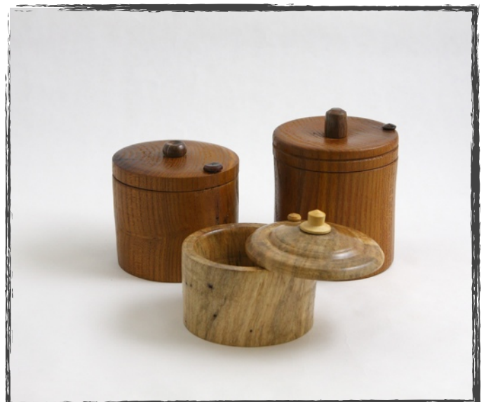
Phil Duffy Salt Boxes