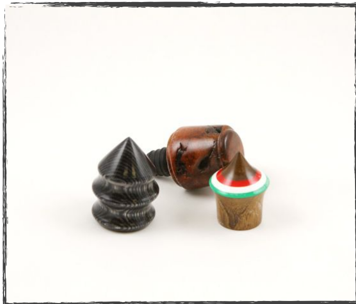
Chuck Bajnai Bottle Toppers