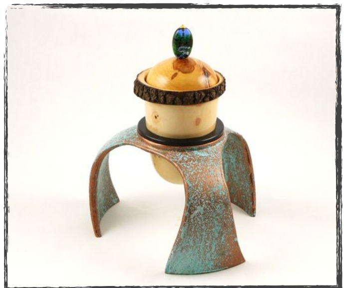
Chuck Mosser Apple & Dogwood Forestry Project