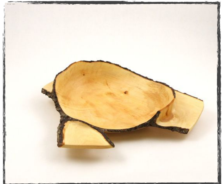
Cody Walker Apple Forestry Project