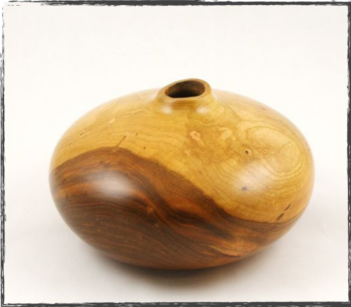
Jim Bumpas Elm Forestry Project