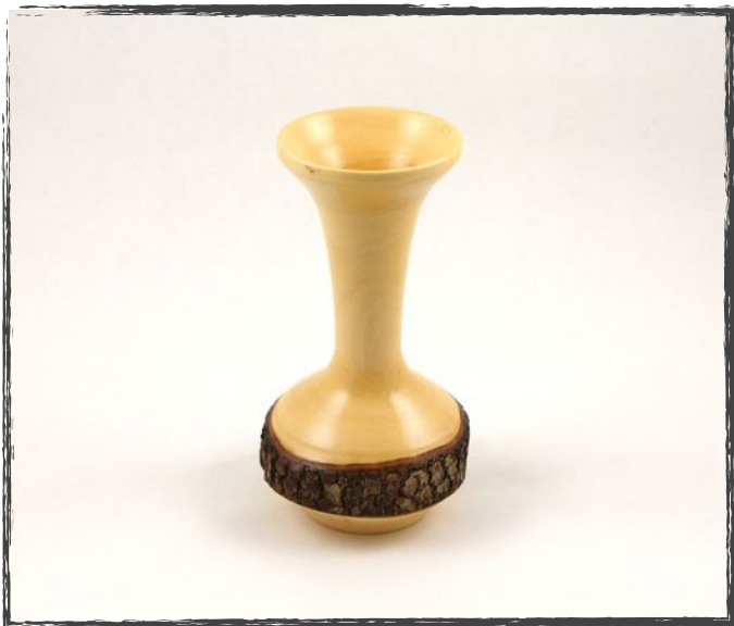
Chuck Mosser Dogwood Forestry Project