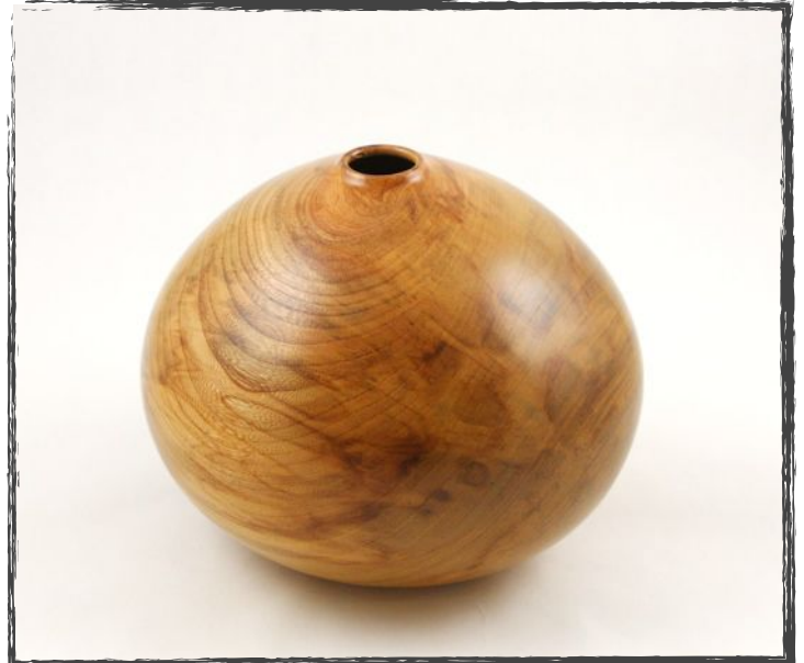
Jim Bumpas Elm Forestry Project