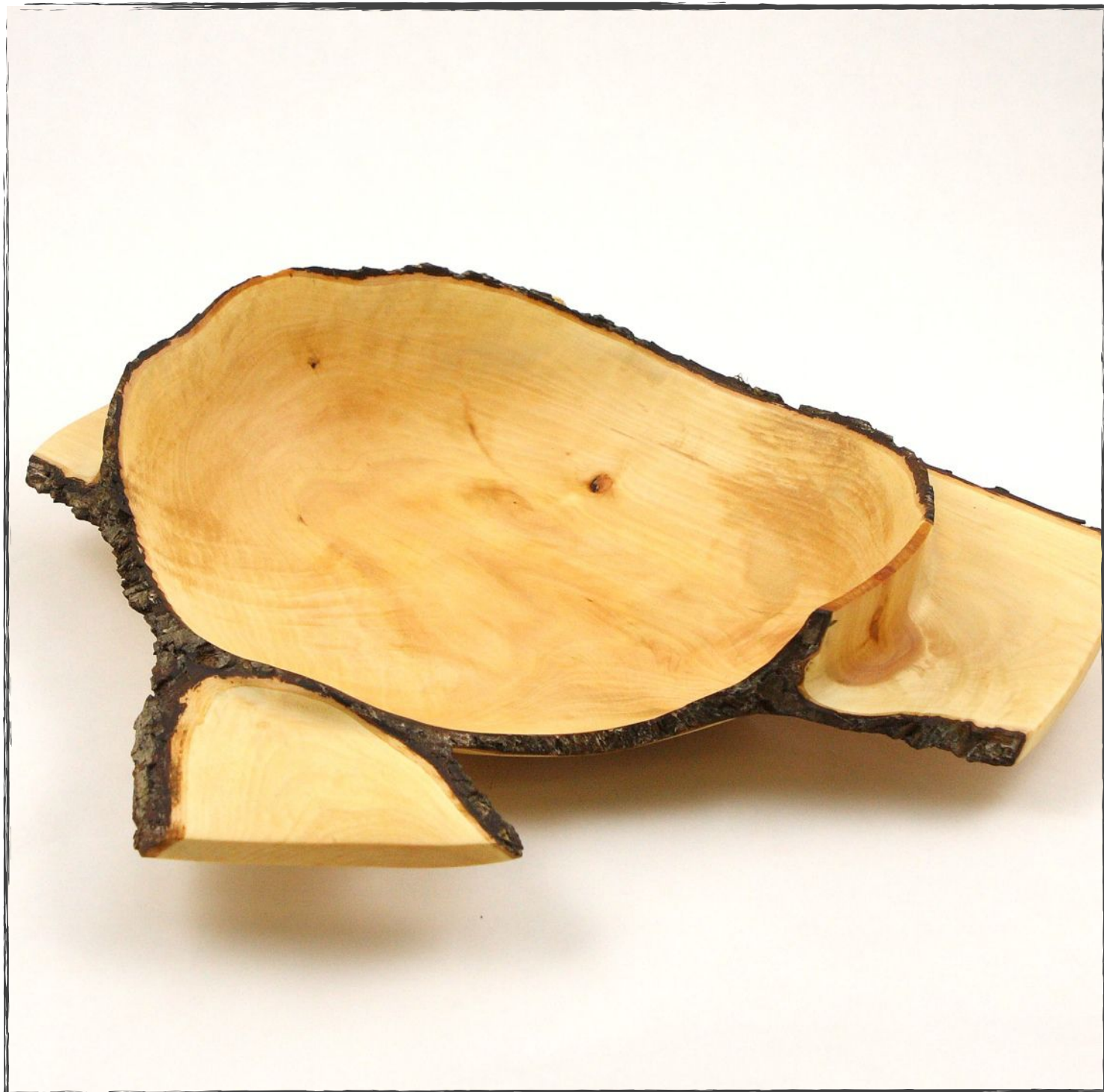
Cody Walker Apple