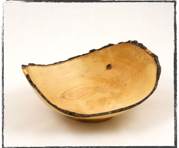
Cody Walker Apple Forestry Project