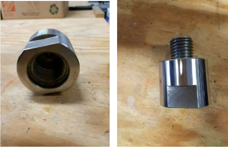
Beall Tool Company 3-On Lathe Mandrel Wood Buffing wheel with wax (never used) - $35