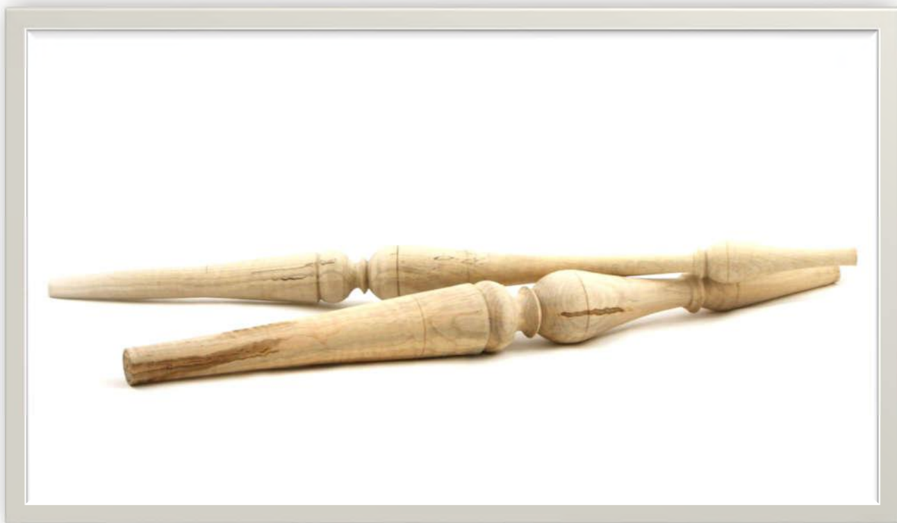
Bill Jenkins, Maple, unfinished, 22 x 1½