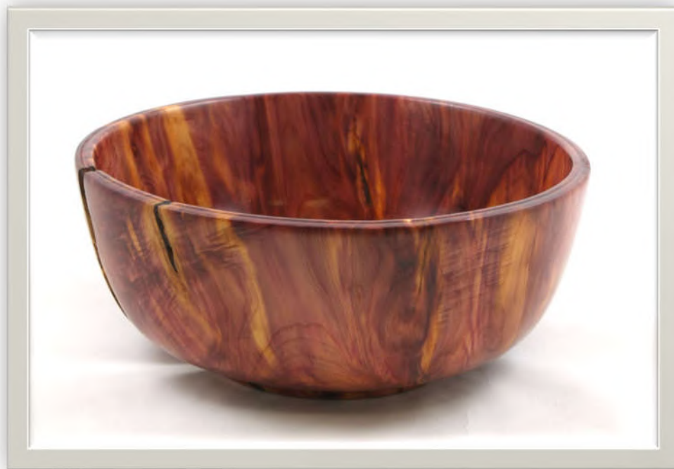
Jim Bishop, Red Cedar, Liberon oil, 10 x 5