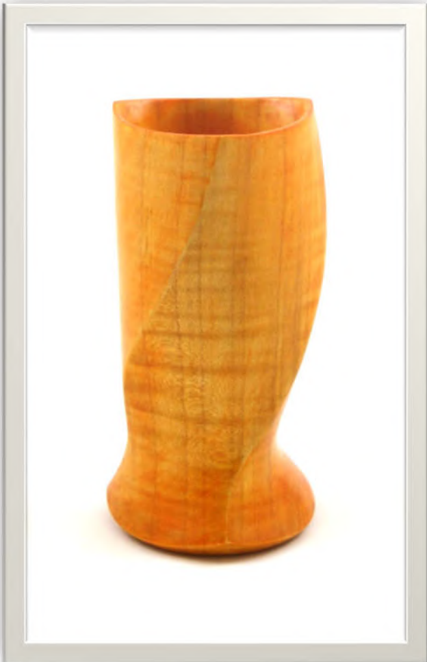
Rollie Sheneman, Maple, Poly Finish, 2 x 5