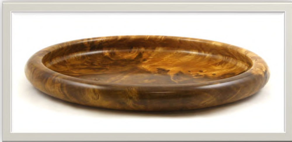
Chuck Mosser, Popular Burl, Lacquer, 11½ x 1¾