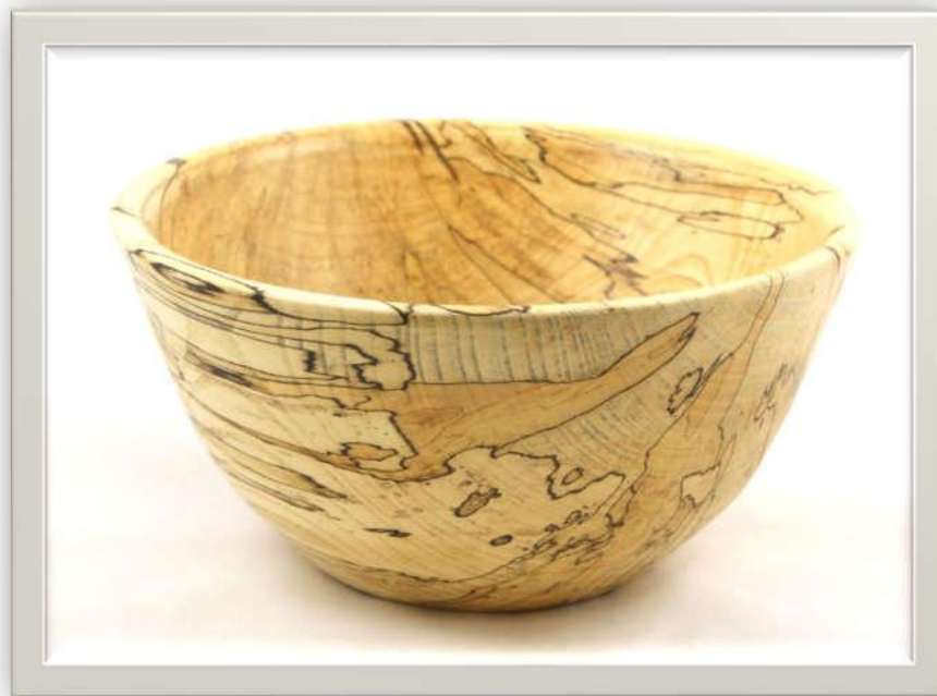
Rob Blader, Spalted maple, Wax, 8 x 4