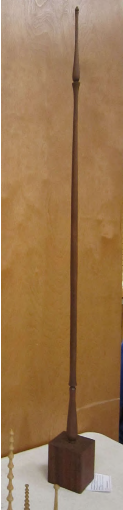
Jim Bumpas 41\frac{1}{2} \times \frac{15}{16}