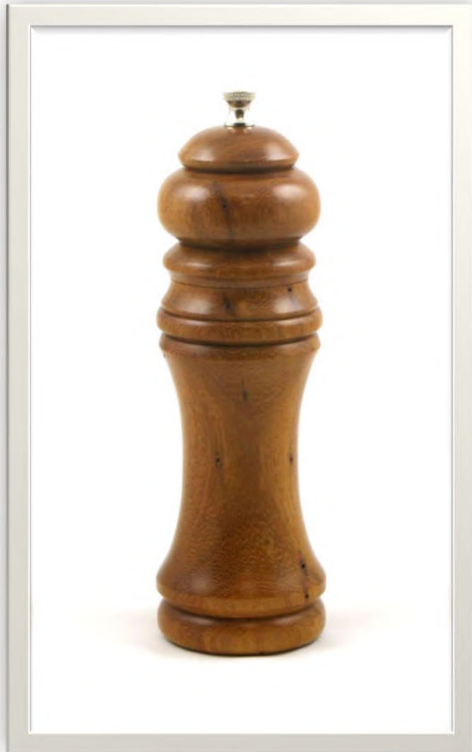
Dean Cox, Rainbow Shower, Brushed Lacquer, 8 x 2½