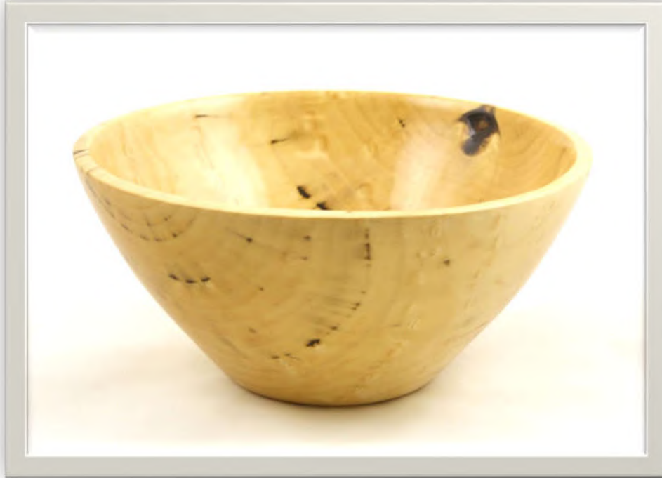
Ray Melton, Natural, maple, 8¼ x 4