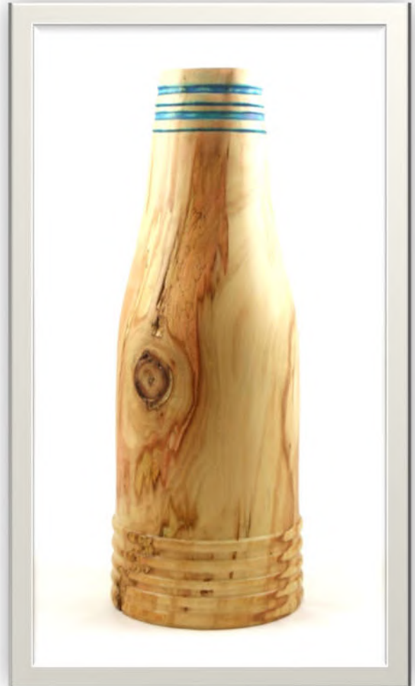
Terry Moore, Spackled Maple General Finish, 6 x 16½