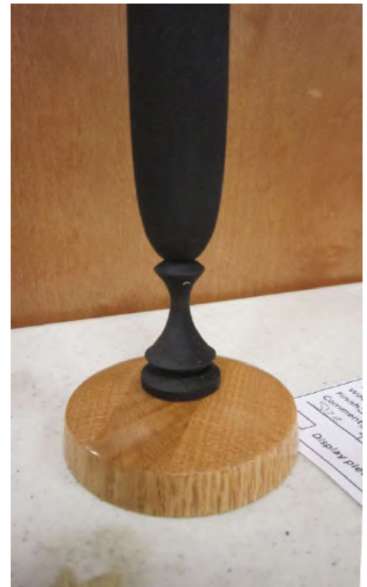
Dan Luttrell - detail