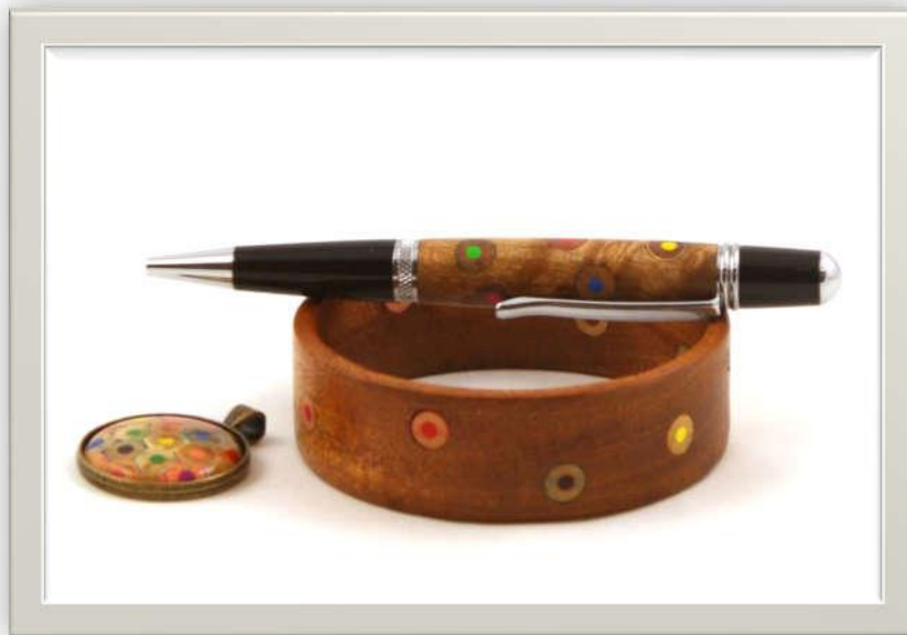
Jim Zorn, Various Finishes and Woods Sizes: Bracelet 3¼, pen 4, jewel 1½