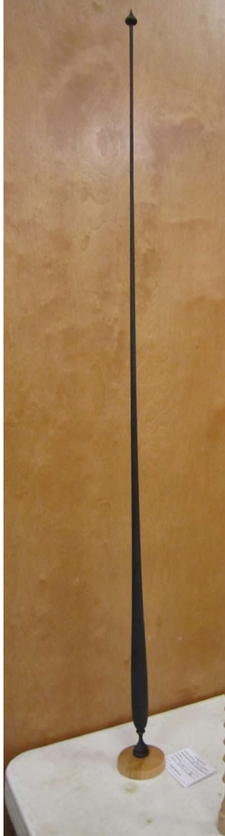
Dan Luttrell 43\frac{1}{2} \times 11\frac{5}{8}