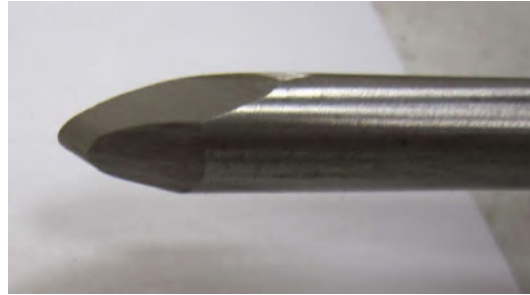
Ray's additional bevel to eliminate bevel heal marks