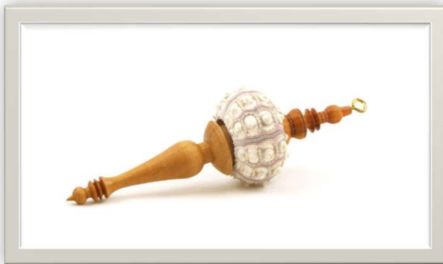
Chuck Horton, Black cherry, Friction polish, 3 pieces (not glued)