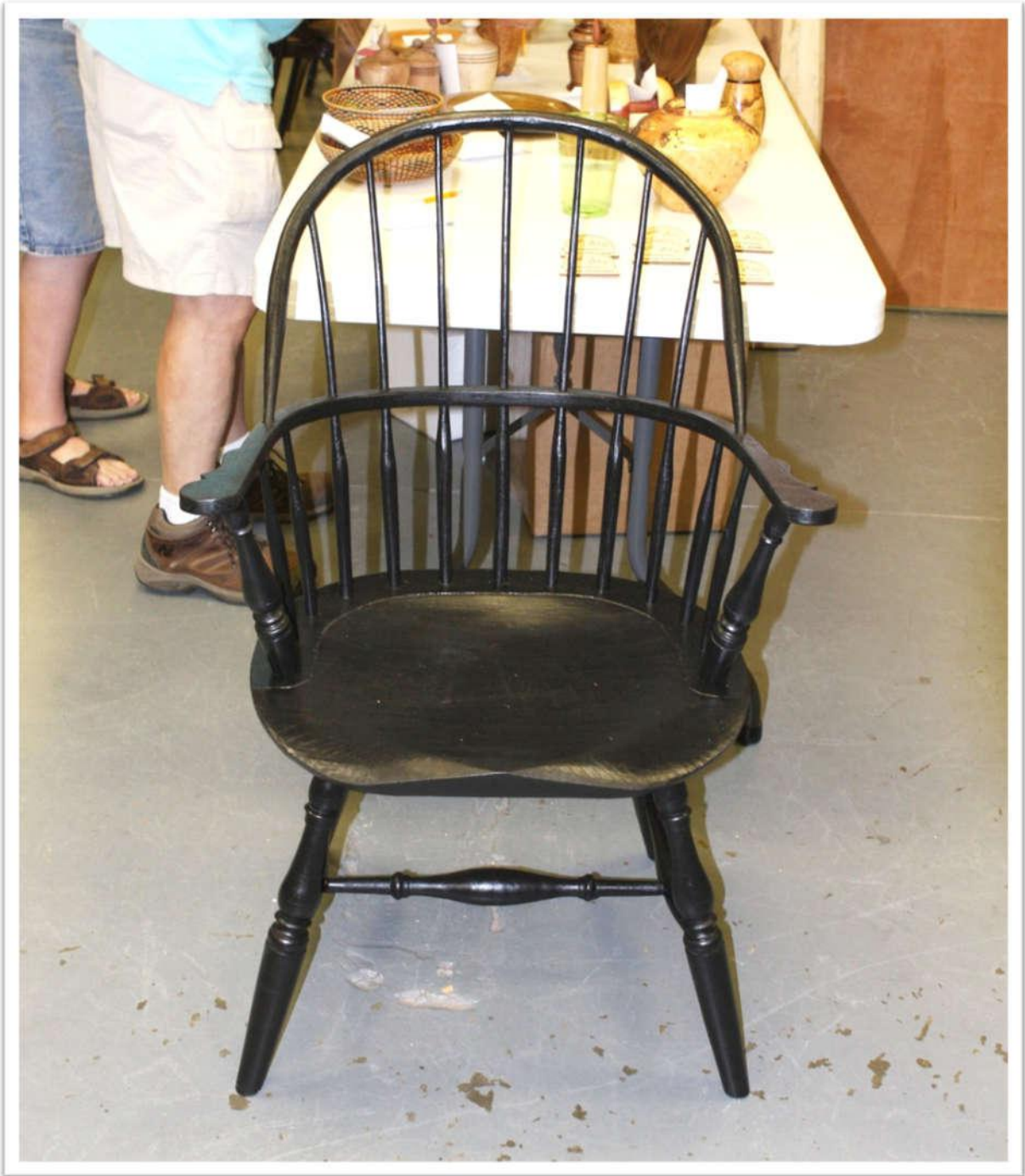
BILL JENKINS – SACK BACK WINDSOR, PAINT