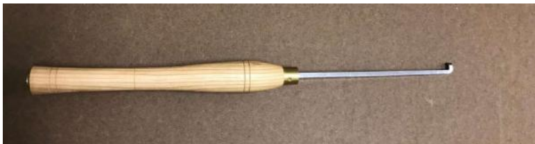
Part of Thread Chasing Set.