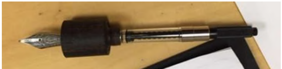
A rough section fitted with nib, housing and ink convertor

The second piece is the lower barrel. This step involves drilling deep enough to hold the ink reservoir, tapping female threads to accept the section made in step one and cutting male threads for the cap. Finally, the cap is made by drilling deep enough for the nib to clear the top followed by tapping the female threads to mate with the lower barrel. With all the holes drilled and threads cut the final shape of the pen is turned