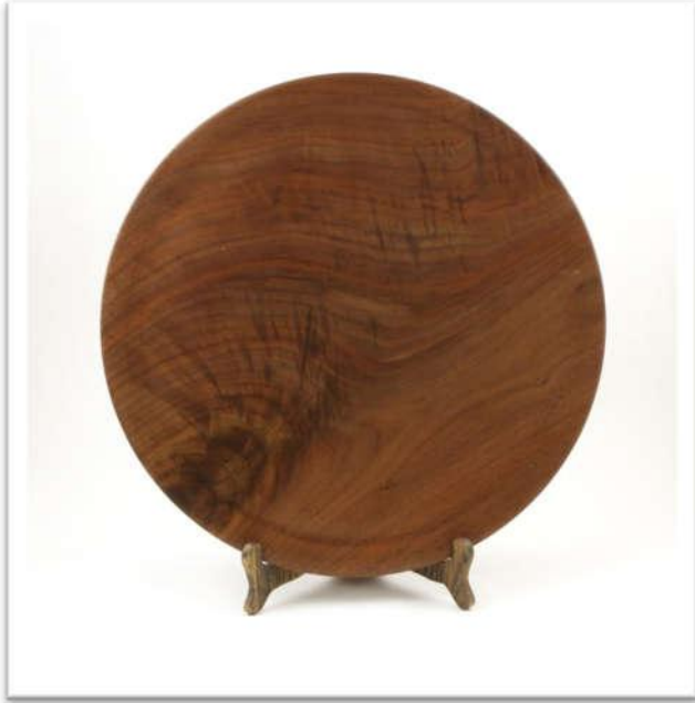
ROLLIE SHENEMAN - WALNUT, WAX, 13"