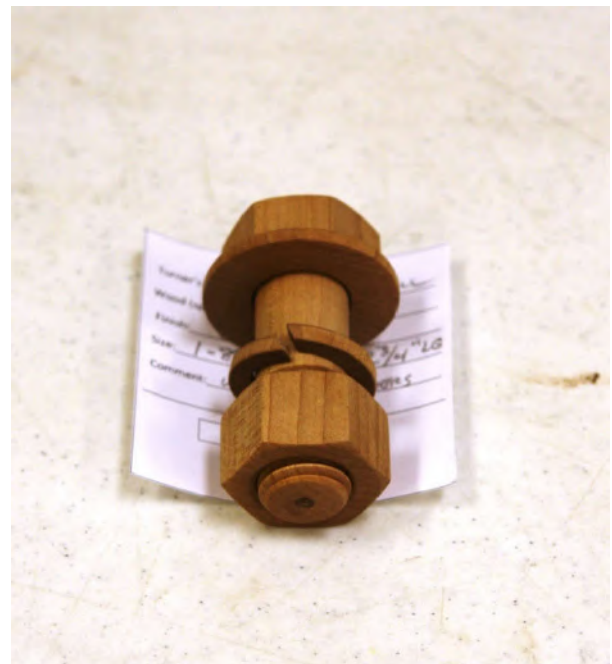
DAN LUTTRELL – MAPLE, OLIVE OIL, 1-8 UN 2B X 2¾" LONG, HEX BOLT, NUT AND WASHERS