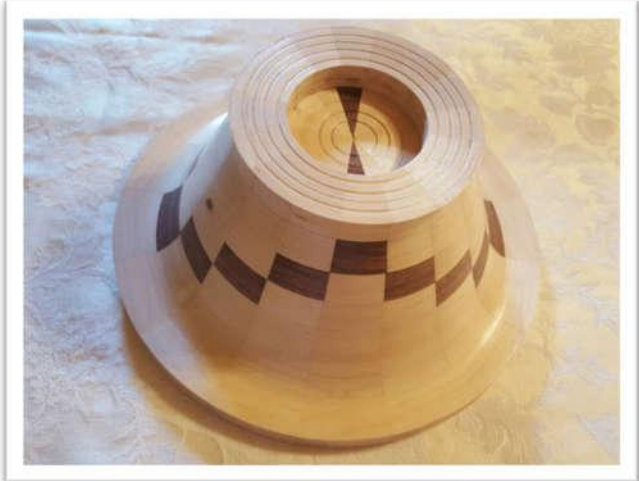
TERRY MOORE – MAPLE AND WALNUT, GENERAL/MIRROR RESIN, 10¾" X 5"