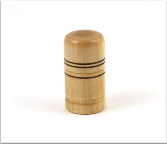
GEORGE PATSKEN - ASH, FRICTION POLISH, 3" X 1¾", FIRST TRY AT A BOX