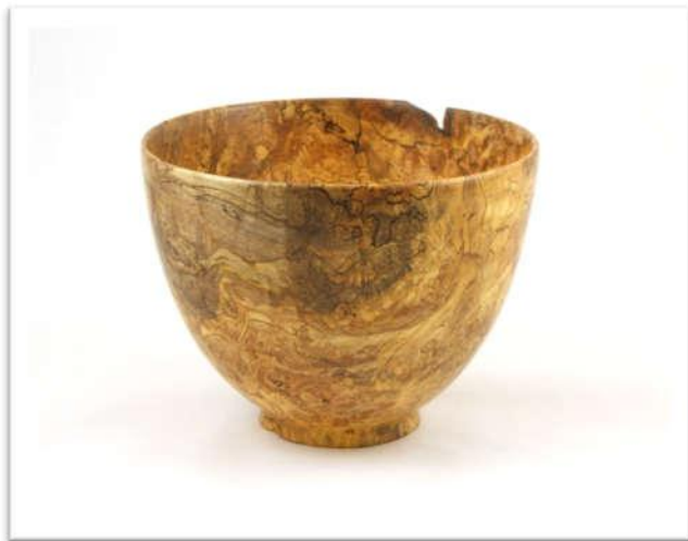
UNKNOWN, MISSING TICKET