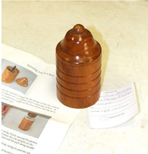
CHUCK MOSSER – MAPLE/ANGELIQUE, LACQUER, 3" X 6", TOY TOP

A TURNING WHERE ONE PIECE FITS INTO ANOTHER (NOT PERMANENTLY GLUED)