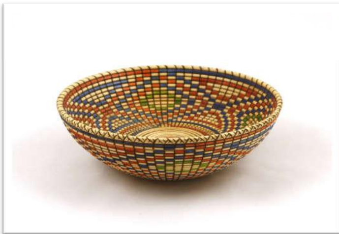
BOB SILKENSEN - ELDER, SPRAY LACQUER, 2" X 7" WIDE, BASKET ILLUSION