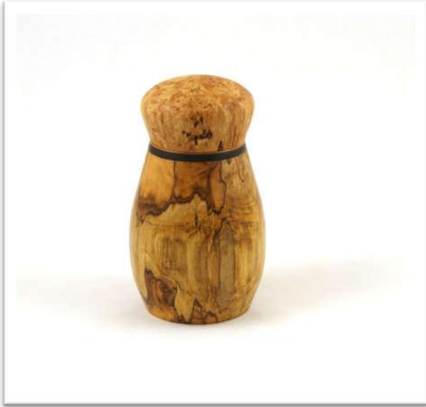
CHUCK MOSSER - MAPLE, BLM, 3½" X 5¼", 3 PART BOX