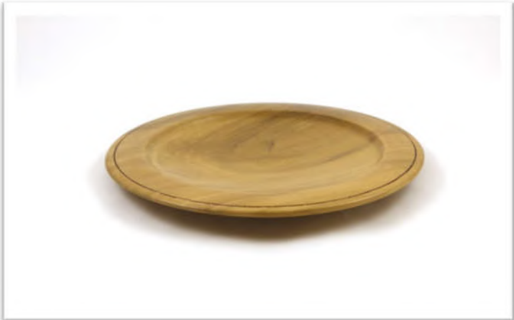
NED ROBERTSON - POPLAR, TUNG OIL, 9½"