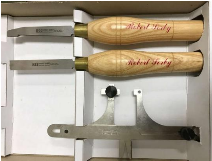
Thread Chasing Set