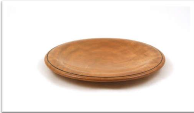
NED ROBERTSON - CHERRY, TUNG OIL, 8½"