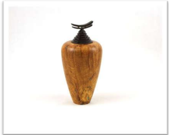
DICK HINES - BIG LEAF MAPLE, WATCO OIL, 4" X 8"