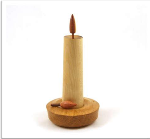
GEORGE PATSKAN, OAK, ELM, CEDAR, AND ROSEWOOD, LACQUER, 8" X 4"