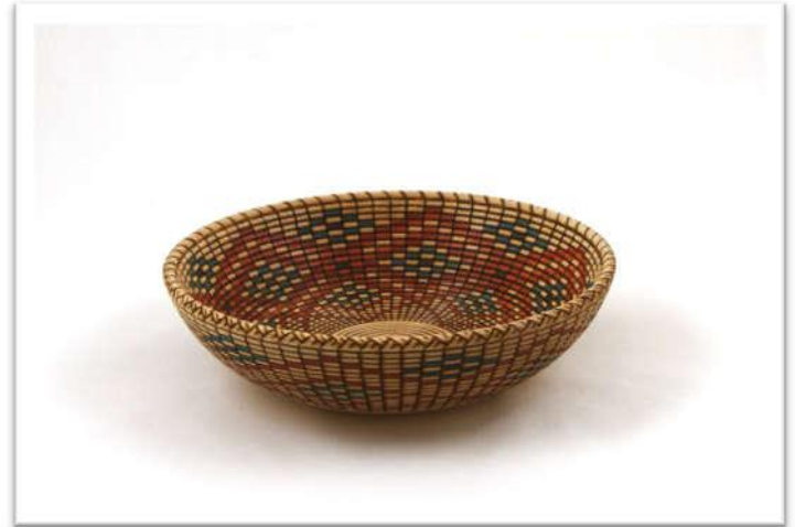
BOB SILKENSEN - MAPLE, SPRAY LACQUER, 2" X 8" WIDE, BASKET ILLUSION