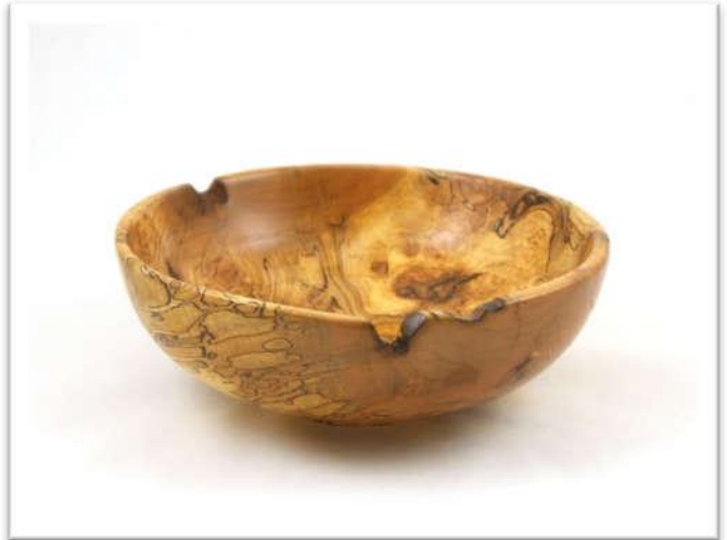
UNKNOWN, MISSING TICKET