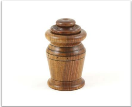
ROLLIE SHENEMAN - WALNUT, WAX, 2½" X 5½"