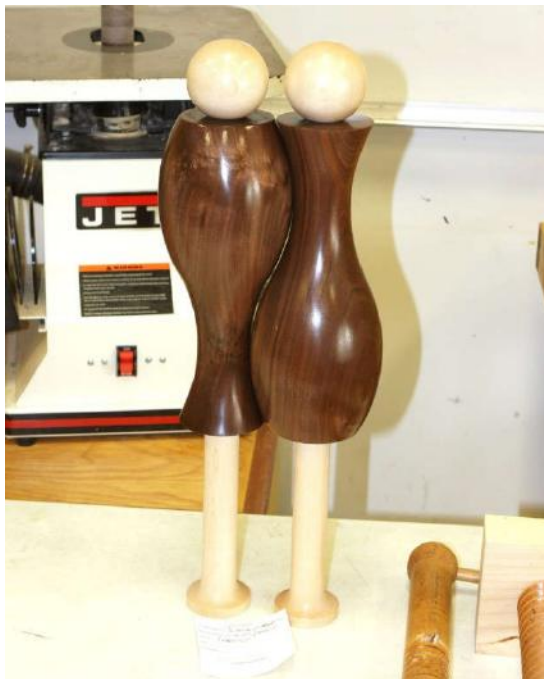
DAN LUTTRELL – WALNUT/MAPLE, LACQUER, 21" X 8", TITLED "MALE AND FEMALE"