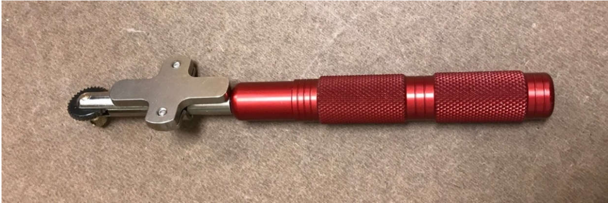
Miniature Spiraling Tool