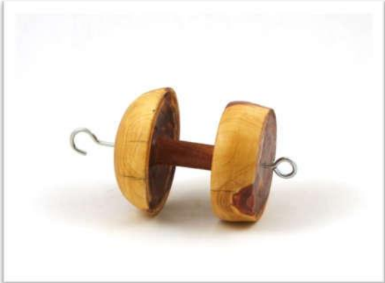
BETSY MACK - CEDAR, CA, 3½" DIA X 4" WIDE, AMT GUARD