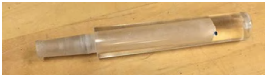
Cody's Kitless Fountain Pen – Best in Show 2017 Richmond Woodturners Competition