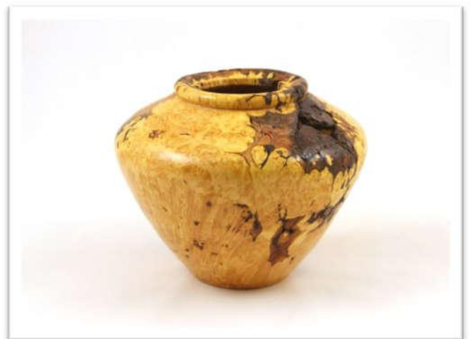
ROBERT GUNDEL - MAPLE BURL, BUFFED & WAXED, 6" X 7" WIDE