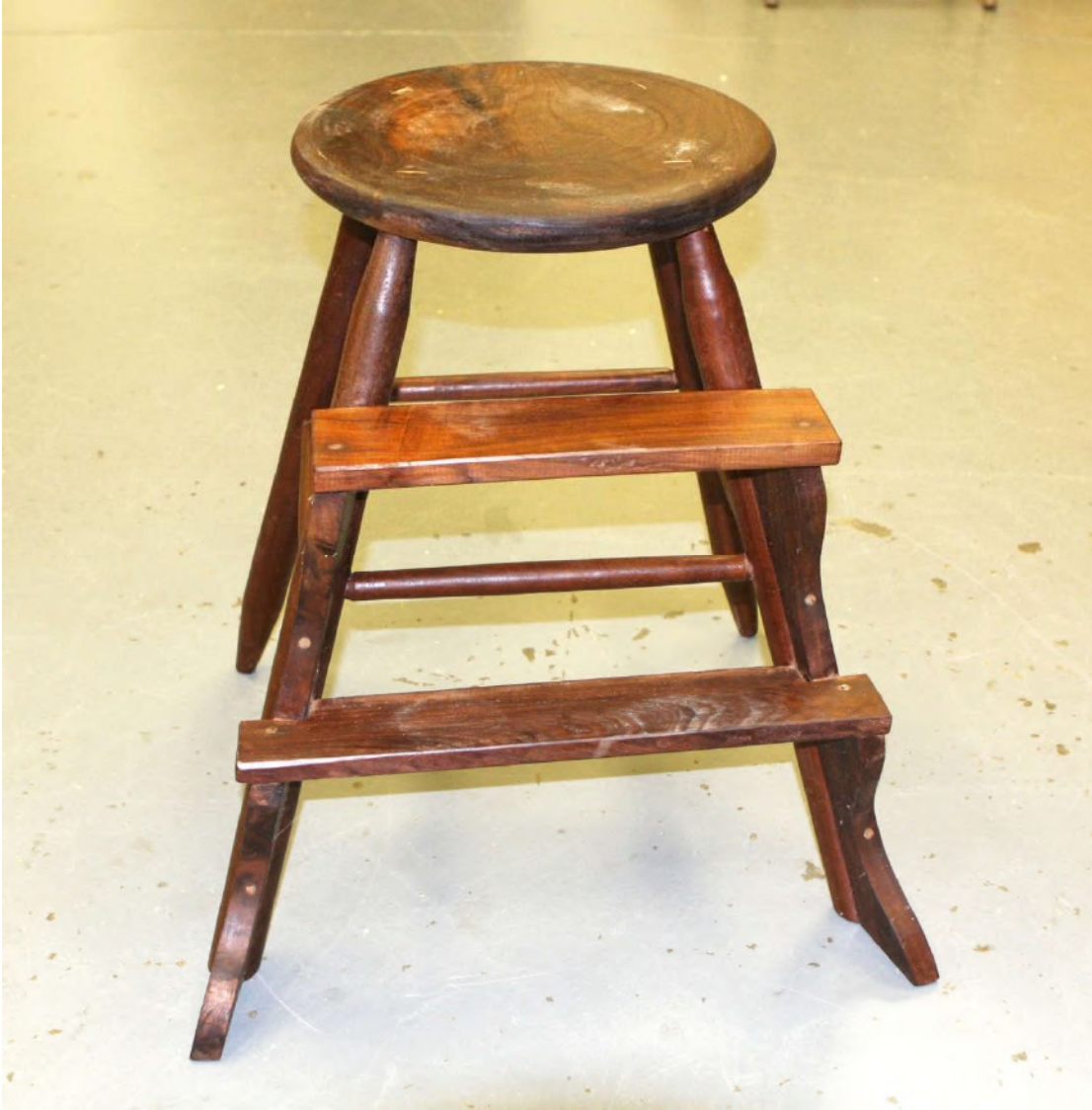
BILL JENKINS - WALNUT STOOL, UNFINISHED

Kolrosing is a very old Scandinavian decorative craft whereby wood is basically tattooed. Unlike carving or engraving no material is removed from the piece, rather, a fine cut is made straight into the wood and some darker material is rubbed into the cut, leaving the cuts nicely darkened. Originally coal dust or pine bark and sawdust were used. It's a simple method, requiring tools you may already have laying around, and depending on the design you use it could be very easy or quite a challenge. Another reason I like this method is the level of fine detail one is able to produce. I'm by no means an expert, but I know enough to get you started, so here we go! See: http://www.instructables.com/id/A-beginners-guide-to-Kolrosing-by-a-beginner/ and https://pinewoodforge.com/basics-of-kolrosing/