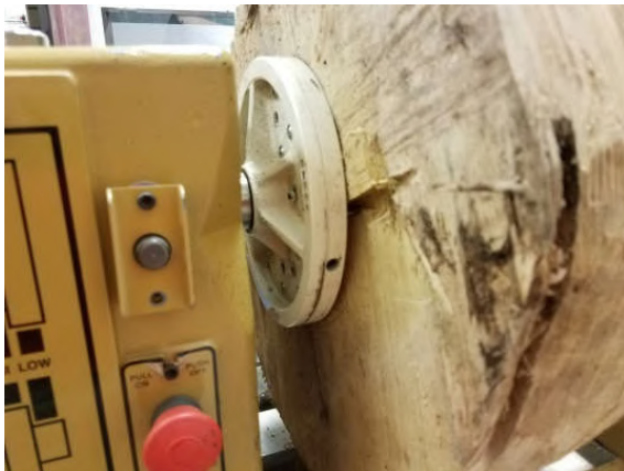
The blank mounted on faceplate with about 20 to 25 screws.

Some additional photos to go along with his article above: