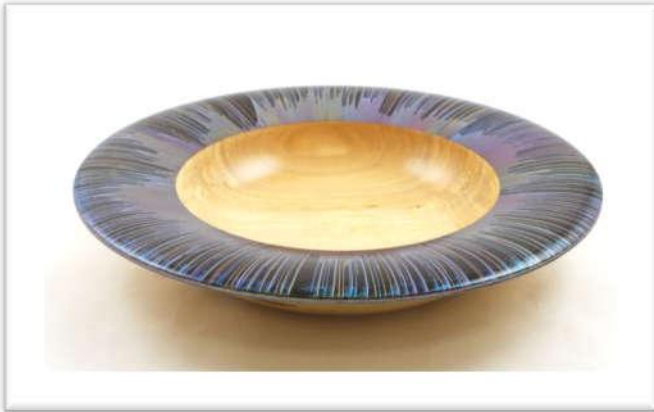
BOB SILKENSEN - MAPLE, SPRAY LACQUER, 12", PAINTED