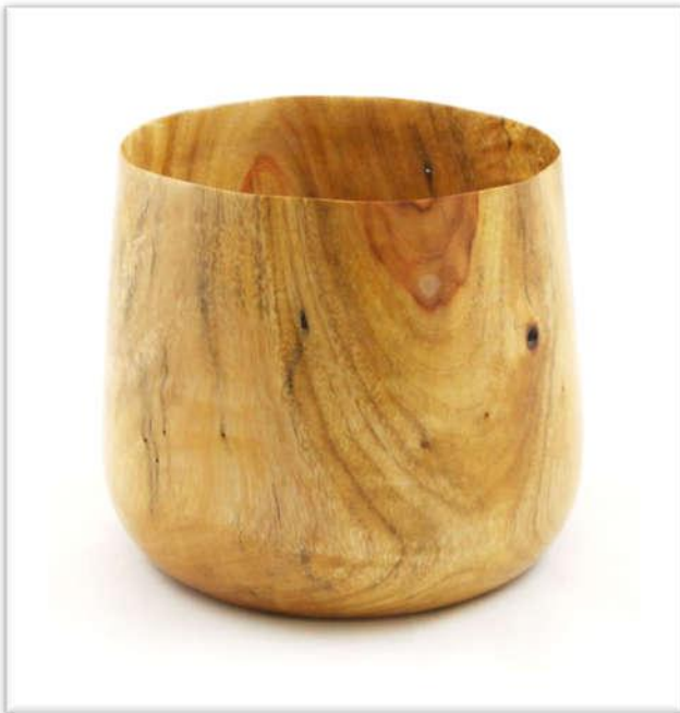
ROBERT GUNDEL - CAMPHOR, BUFFED & WAXED, 6" X 6"