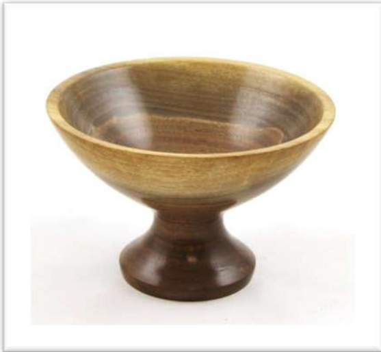
CHUCK HORTON - WALNUT, ANTIQUE OIL, BUFFED & WAXED,