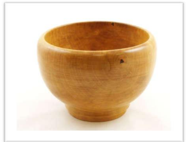
PHIL DUFFY - PEAR WOOD, COMMON, 7"