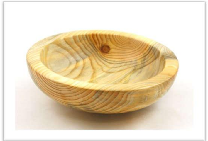
BRAD MILLER - PINE, WAX