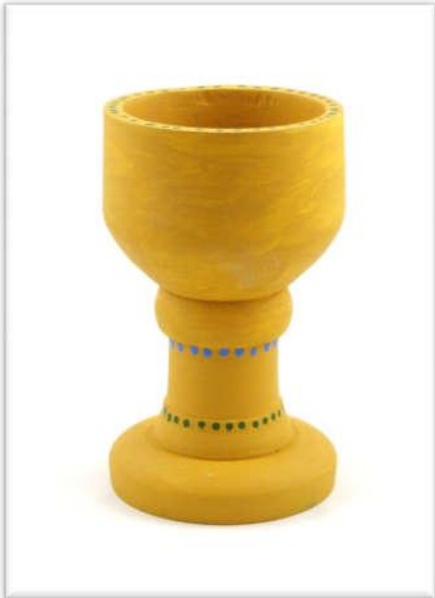
BETSY MACK - PECAN, UNFINISHED, WIZARD GOBLET