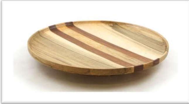
DOUG MURRAY - MAPLE/WALNUT, VARNISH, 11"