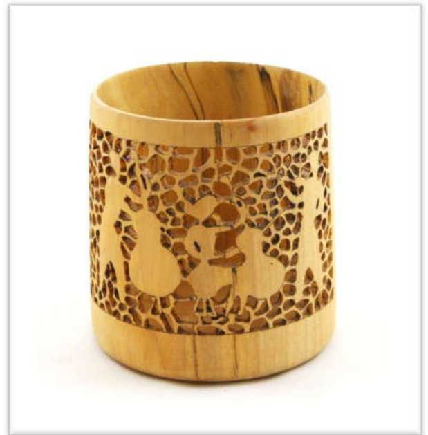
BRUCE ROBBINS - MAPLE, OIL