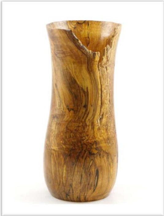
ROBERT GUNDEL - SPALTED MAPLE, BUFFED & WAXED, 7" WIDE X 14"