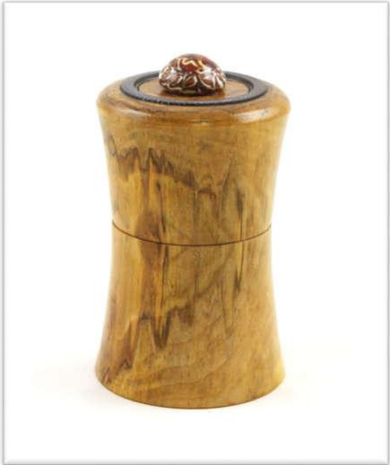
CHUCK MOSSER - MAPLE, LACQUER, TEXTURED BLACKWOOD & GLASS