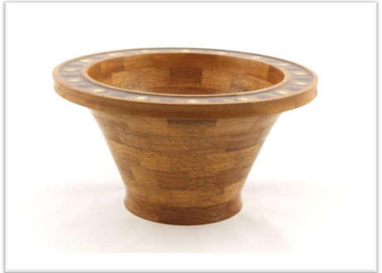
TERRY MOORE - MAHOGANY, GENERAL