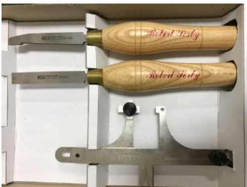
Thread Chasing Set