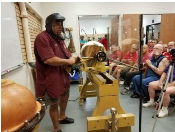
All dressed up for action - the point is "safety"