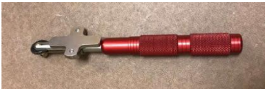
Miniature Spiraling Tool