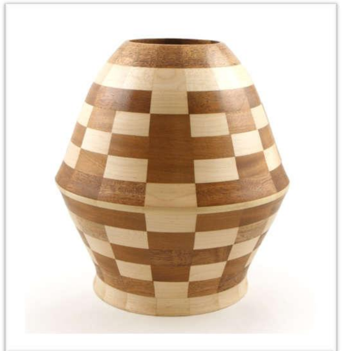
TERRY MOORE - MAHOGANY/WHITE MAPLE, GENERAL