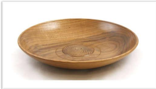
BOB SILKENSEN - WALNUT TUNG OIL, 12"