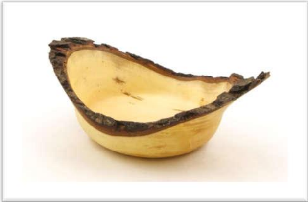
BRAD MILLER - MAPLE, WAX OVER