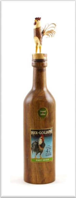
ROLLIE SHENEMAN - WALNUT, WAX, 4"X