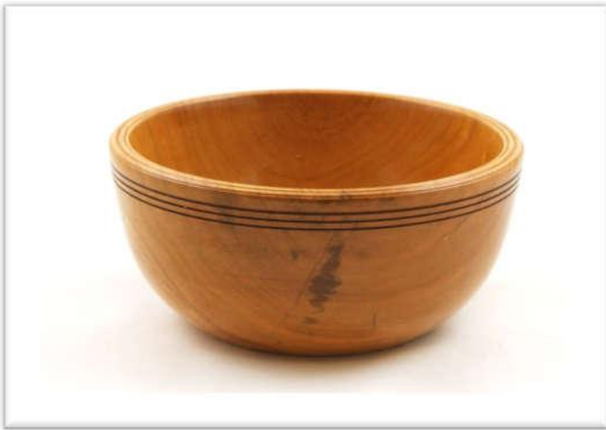
RON BISHOP - CHERRY, LIBERON, 8", A SIMPLE BOWL