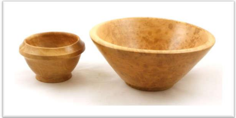
PHIL DUFFY - PEAR WOOD, COMMON FINISH