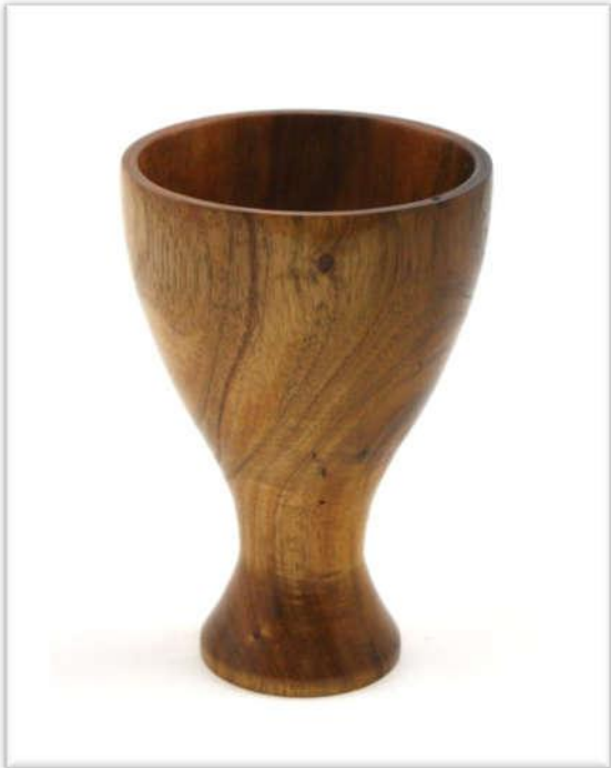
CHUCK HORTON - KOA, WIPED ON POLY, 7" X 3", END GRAIN