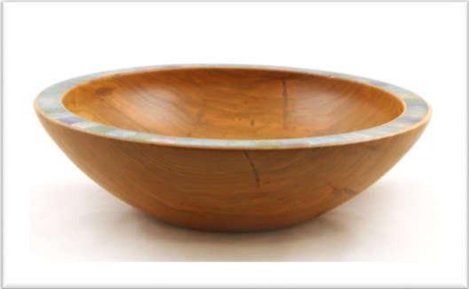
ROYAL WOOD - CHERRY, WALNUT OIL, 10"

For KOLROSING information and definition see footnote at the end of the Show and Tell Section