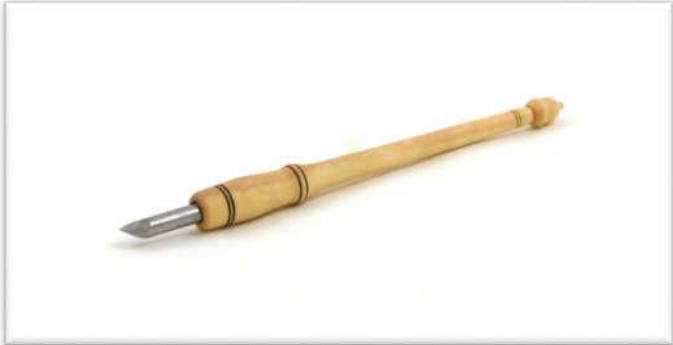
MEGAN SHOGREN - DOGWOOD, TRIED & TRUE, 7", KOLROSING KNIFE, FOREST