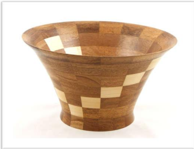
TERRY MOORE - MAHOGANY/MAPLE, GENERAL