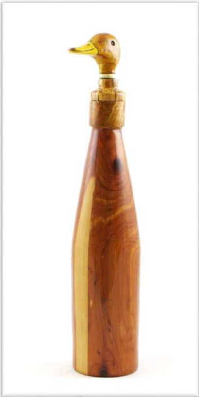
ROLLIE SHENEMAN - CEDAR, WAX, 3" X14"

For KOLROSING information and definition see footnote at the end of the Show and Tell Section