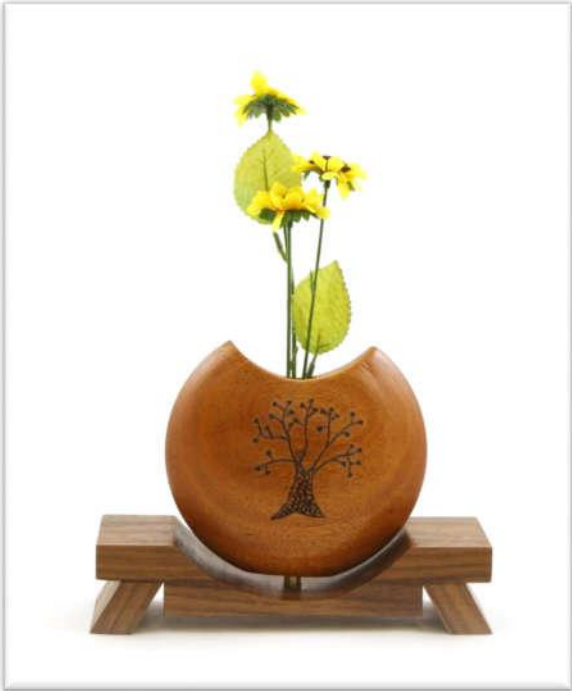
JIM ZORN – MAHOGANY/WALNUT, SEMI GLOSS (GF)