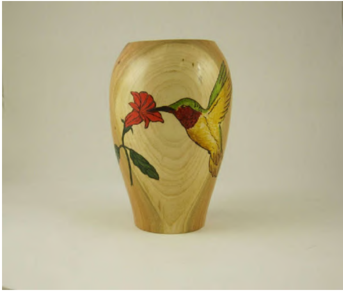
BOB SILKENSEN, CHERRY, 8" TALL VASE WITH HUMMING BIRD, BURNED AND WIRED