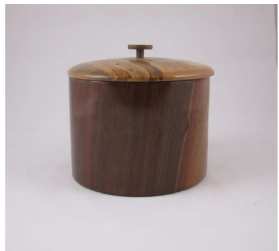
JIM ZORN, SP MAPLE, BLOODWOOD, FRICTION, AFRICAN BLACKWOOD, 6" X 5 1/2" HIGH