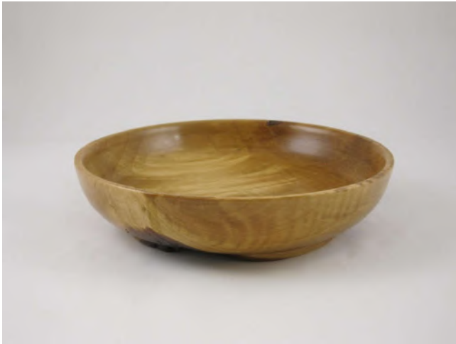
PHIL DUFFY, PEAR, VARNISH, 7", PEAR CROTCH