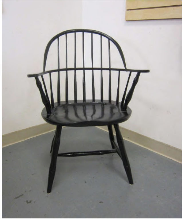
BOB MARCHESE, OAK, ASH & PINE, PAINTED BLACK, 36 X 22", SACK BACK WINDSOR

Thermally modified wood is wood that has been modified by a controlled pyrolysis process of wood being heated (> 180 °C) in absence of oxygen inducing some chemical changes to the chemical structures of cell wall components (lignin, cellulose and hemicellulose) in the wood in order to increase its durability. Low oxygen content prevents the wood from burning at these high temperatures. Several different technologies are introduced using different media including nitrogen gas, steam and hot oil. From Wikipedia, the free encyclopedia .