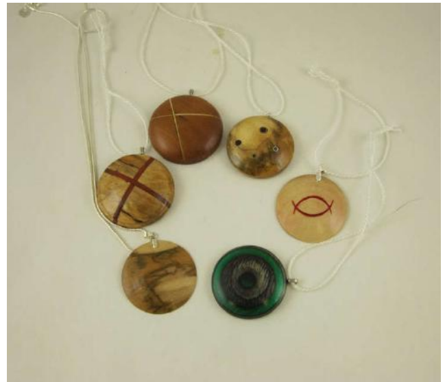
JERRY FISHER, 6 PENDANTS, EACH 1 3/4", VARIOUS CONSTRUCTIONS AND FINISHES