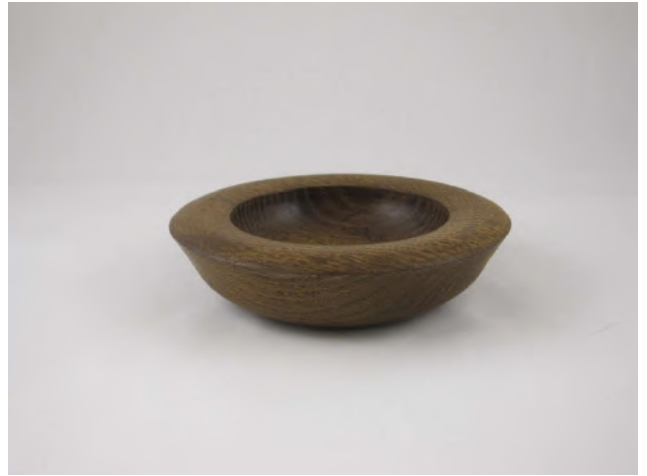
GORDON KENDRICK, THERMALLY MODIFIED RED OAK, UNFINISHED, 6½" X 1¾"