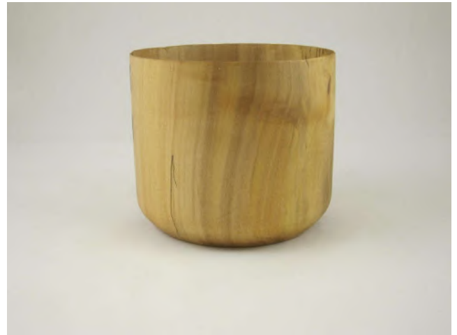
BRUCE ROBBINS, MAPLE, OIL, 4¾ X 4½"