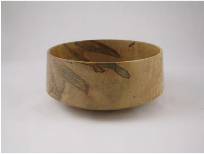
DOUG MURRAY, AMBROSIA MAPLE, POLY, 6½" X 3¼"