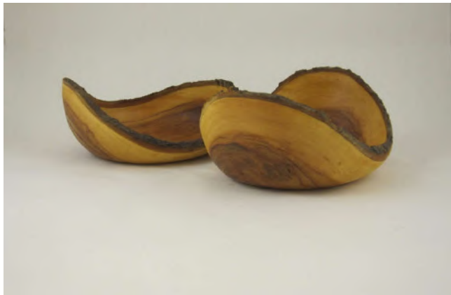
CHUCK MOSSER, MAPLE, WATCO, TWO HALVES OF THE SAME LOG