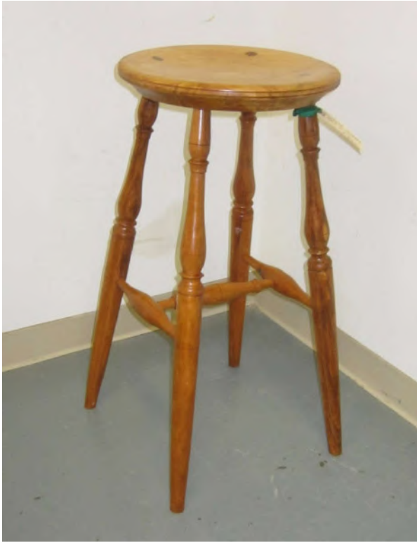
BILL JENKINS, CHERRY, VARNISH, 15 X 32" BAR STOOL