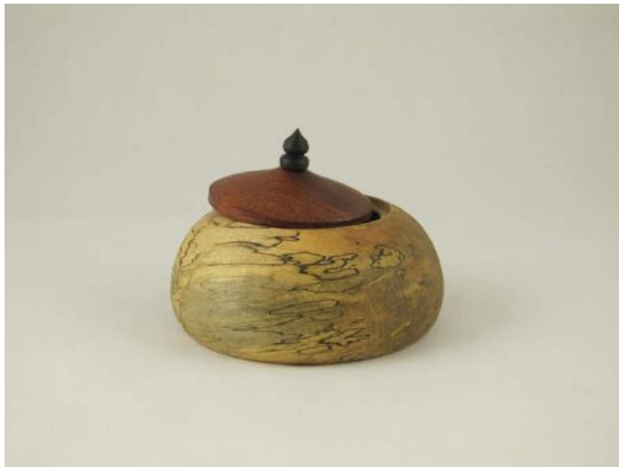
JIM ZORN, WALNUT, SPALTED MAPLE, POLY