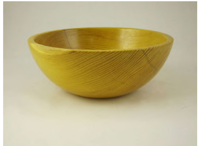
RON BISHOP, OSAGE ORANGE, LIBERON, 10" X 4", SIMPLE BOWL