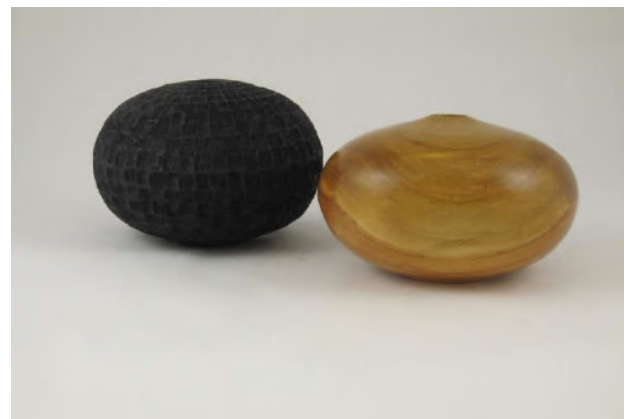
JIM BUMPAS, CHERRY, WATERLOX, 3½ X 5" AND 3 X 5",