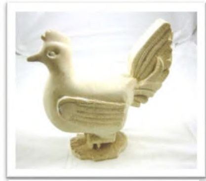
ROLLIE S, BASSWOOD, 4 x 4 x 12, CHICKEN