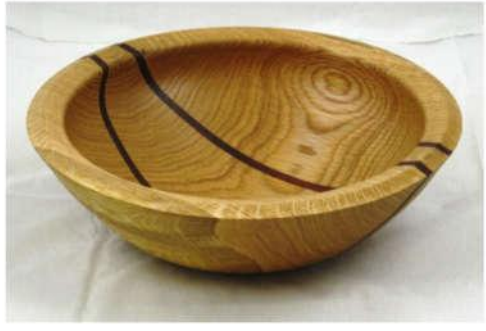
CHUCK MOSSER, OAK & PADAUK, WATCO OIL