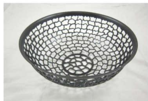
DAN LUTTRELL, MAPLE, PAINTED, 11 x 4, PIERCED BOWL