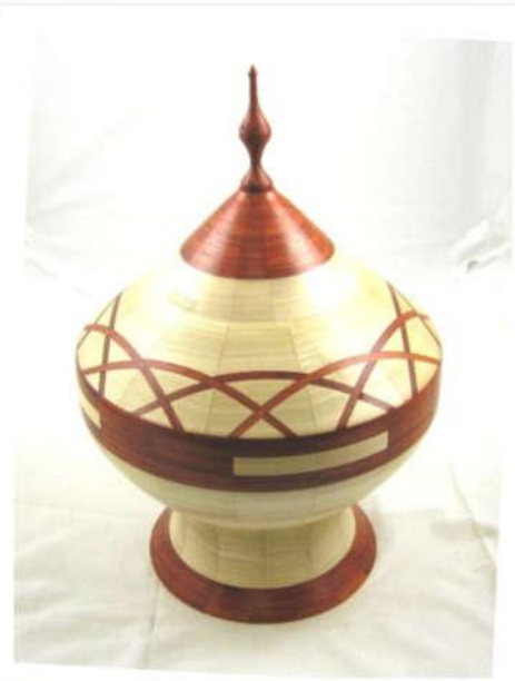
TERRY MOORE, POPLAR & PADAUK, GENERAL, 10 x 14, 205 PIECES