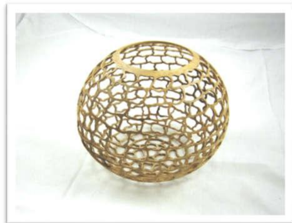
DAN LUTTRELL, MAPLE, LACQUER, 6¼ x 6¼, PIERCED FISH BOWL