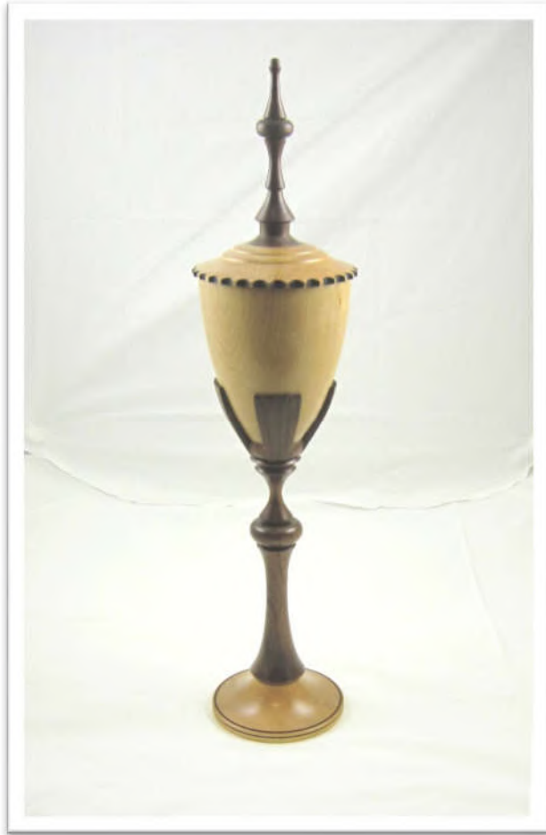
DOUG MURRAY, MAPLE & WALNUT, POLYURETHANE, 4 x 19, LIDDED CHALICE