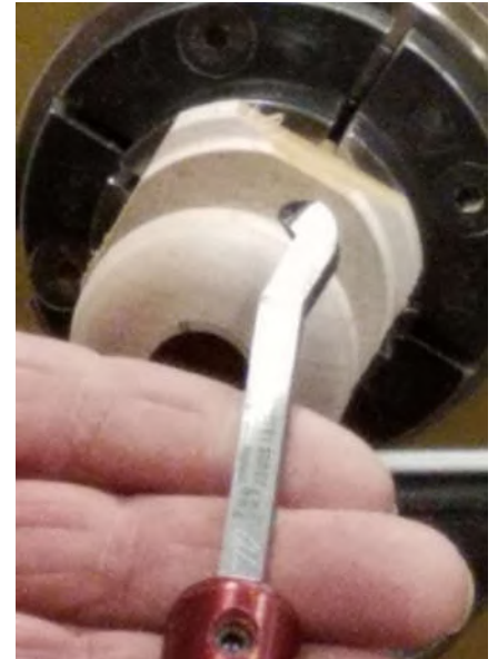
Some of the tools Alam used