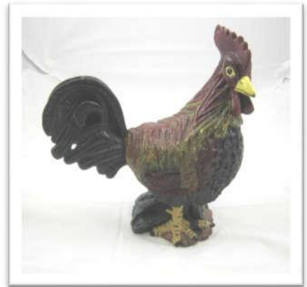
ROLLIE S, BASSWOOD, 4 x 4 x 12, CHICKEN ROOSTER