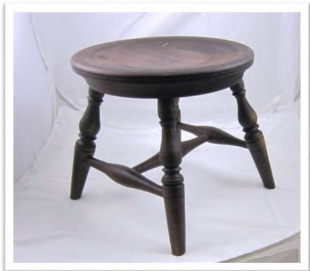
BILL JENKINS, WALNUT, 12 x 12 HIGH, LAST OF AN ORDER OF 12