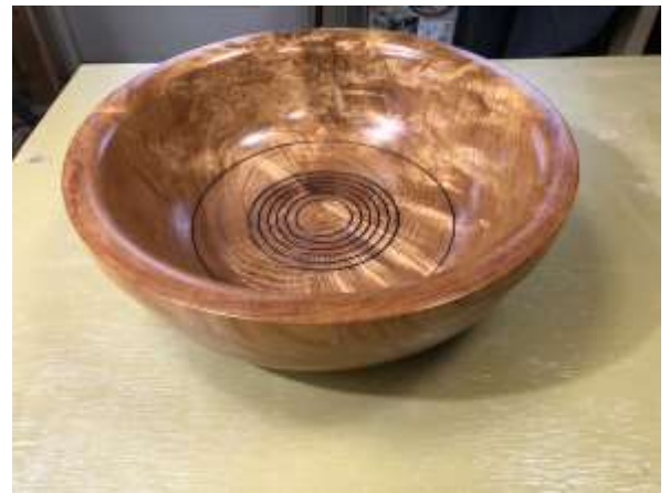
Alan Harrell, This is a 14 x 5 inch cherry bowl with tung oil finish