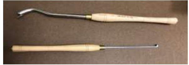
Set of Hollowing Tools