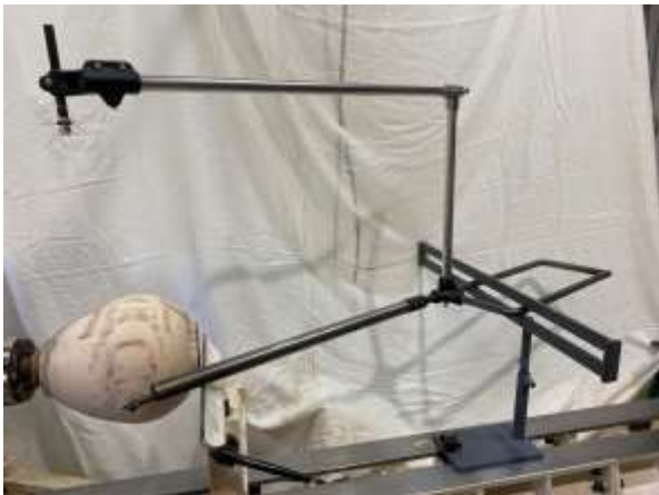
Jamieson Hollowing Rig, As Set Up and in Use