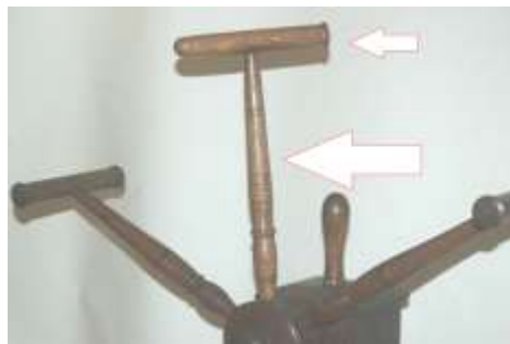
Walt Connerm. my first-ever project, I have pointed at the replacement spindle for a friend's yarn winder, 13" long and 1 1/4" in diameter