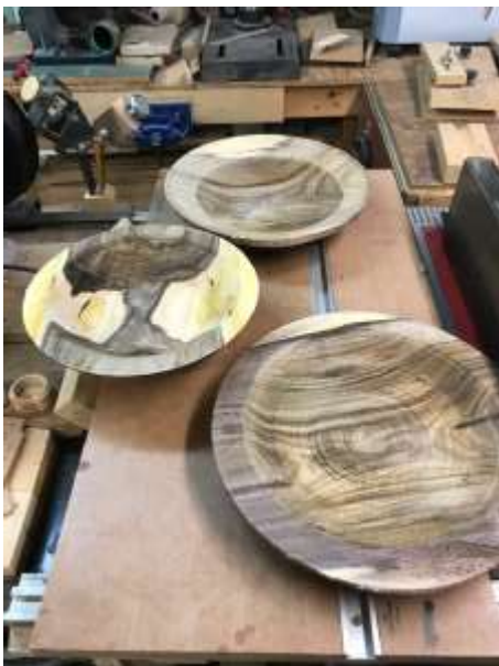
Chuck B, In Progress