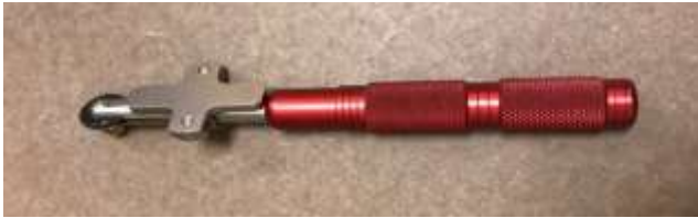
Spiral Texturing Tool