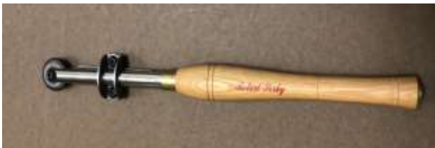
Spiral Texturing Tool