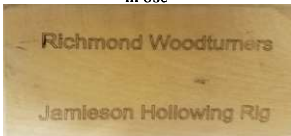
Jamieson Hollowing Rig - Stored in large Box in Cabinet