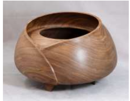
Dave Bushman, It is black walnut with a wipe on poly finish