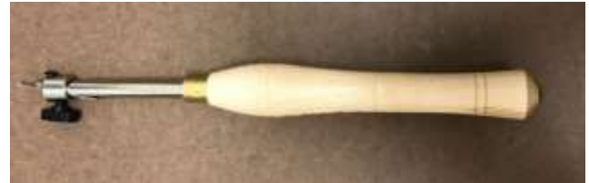
Chatter Texturing Tool