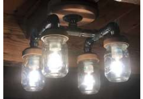
Cody Walker, Redneck Chandelier- five turned elements, stained Maple