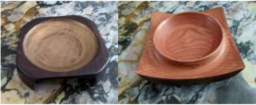
Jerry Harvey, The brown one is dyed Silver Maple, four legs turned in the turning process. Gold wax guild in the top, 8" X 8". The other is Ash, 10" X 10" colored with copper kettle metallic luster wax. Both finished with Yorkshire grit before wax.