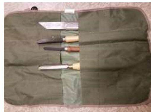
Two sets of tools