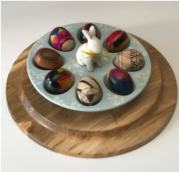
Chuck Horton: various styles and finishes for Easter eggs. Maple wood burned, maple with dyed lacquer, and laminated. Photographed with an I-phone in indirect sunlight on a foam board background. No retouching other than cropping.