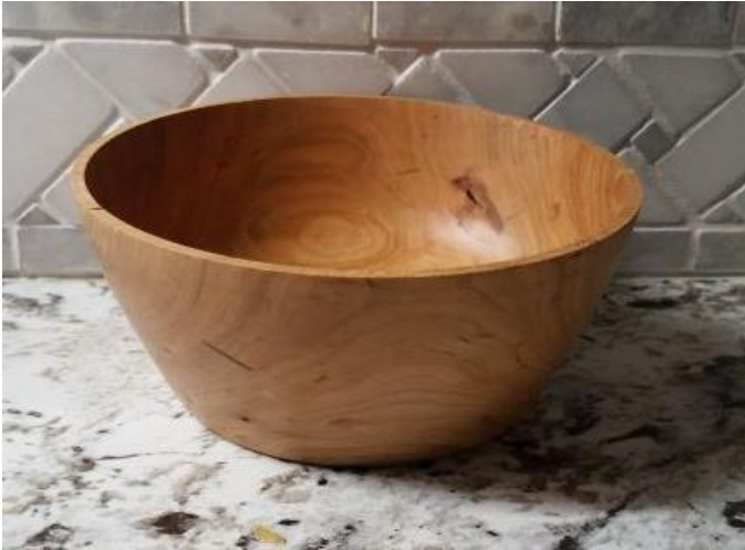
Robert Marchese: Unknown species, wipe on poly finish, 5.5" x 3" tall. Very similar to last month!