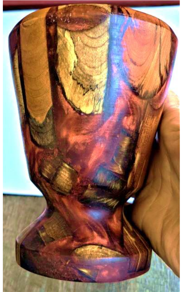
Jerry Harvey: Redwood slats and pieces in epoxy resin with pressure pot, Yorkshire grit and homemade friction polish.