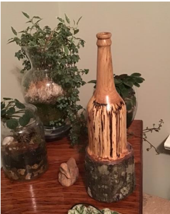
Bill Buchanon: Wine bottle transition from 4" limb. Spalted Oak. 3-4" dia. x 13" tall.