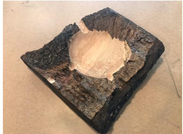
Dan Lutrell: Top view of ash tray.