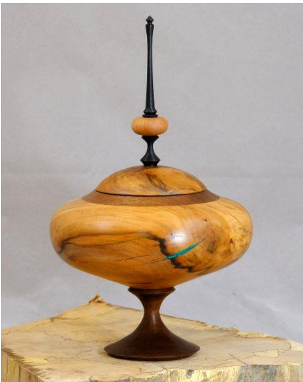
David Bushman: maple lidded vessel with a walnut base and ring with an ebony finial. The finish is wipe on poly. The inlays are malachite and fake red coral.