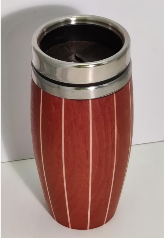
The finish is shellac & walnut oil friction polish.