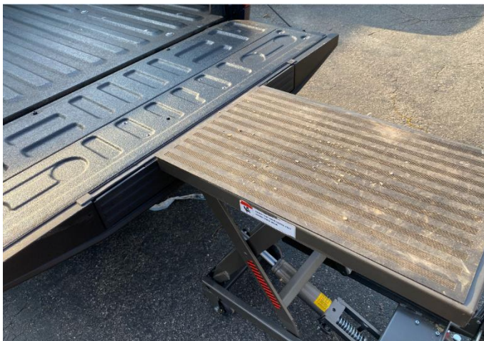
Lift to your tailgate

I bought this cart after purchasing something else large from Harbor Freight (I think it was a tool chest). They were able to lift the box up to the same height as my tailgate and it was easy to load the item. Of course, they used it again when I went back to buy the cart.