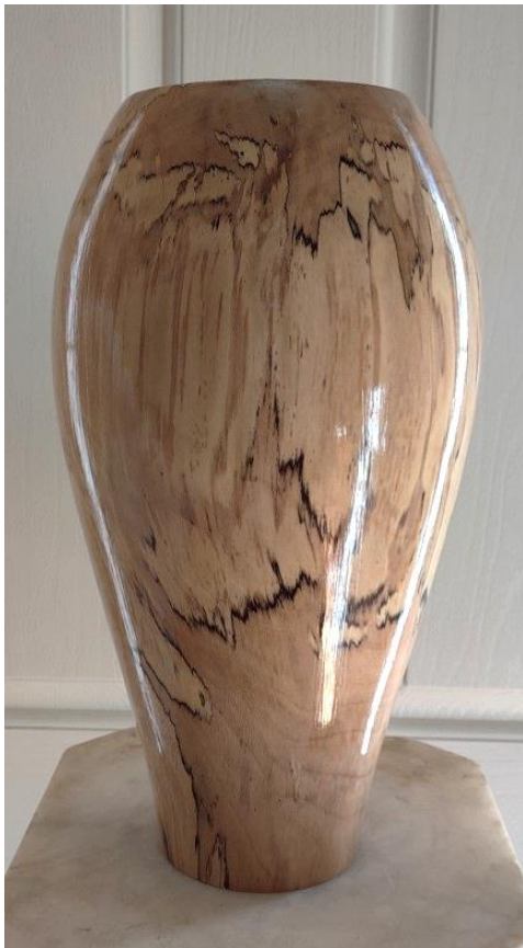
Spalted Sycamore vase, 7" x 14" tall, 1/8" wall, with a gloss lacquer finish. He has not decided how to deal with the split: leave it or lace it.? Since the split is on the less interesting side, he may just leave it and let it face the wall.