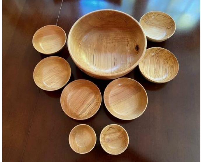
Salad serving set for six, with two nut cups. White Birch.