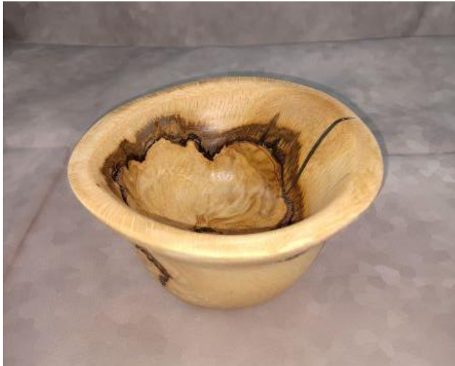
Swamp oak, 6" dia. x 3", finished with sanding sealer.