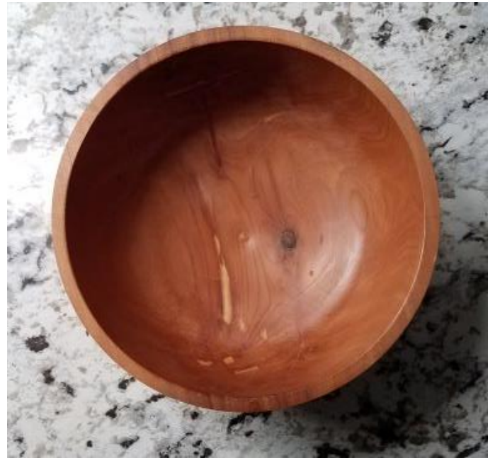
Eastern Red Cedar, 8" x 3.75".