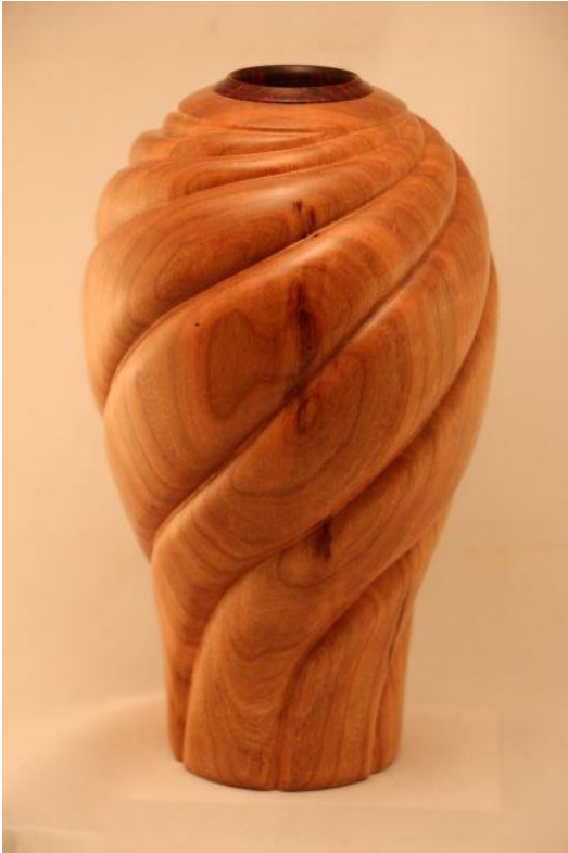
Cherry and Cocobolo. It is 11" high x 5" diameter and finished with Liberon Finishing Oil.