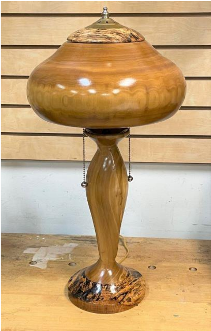
“Let there be light.”