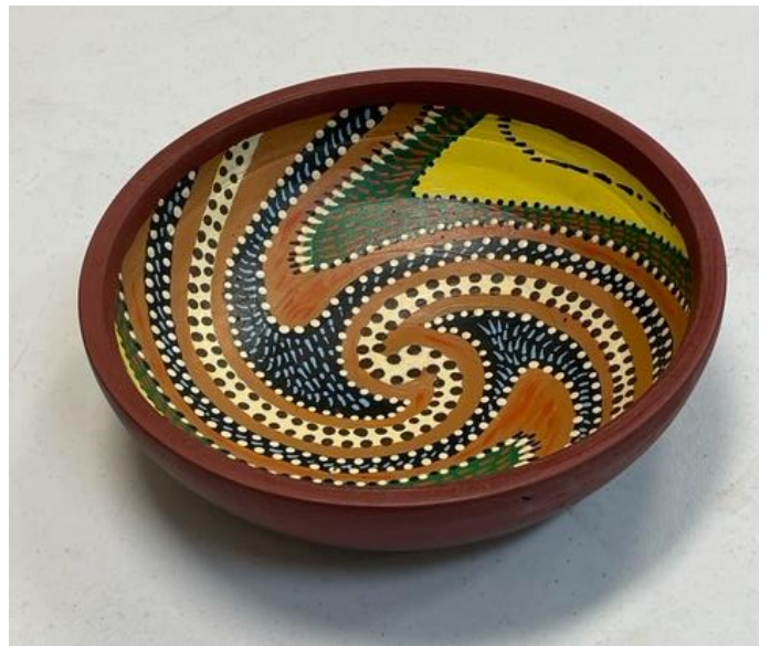
Painted basket illusion from Jim Zorn.