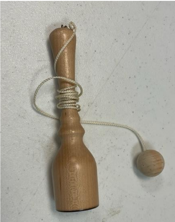
This is a Cup and Ball toy from _____?