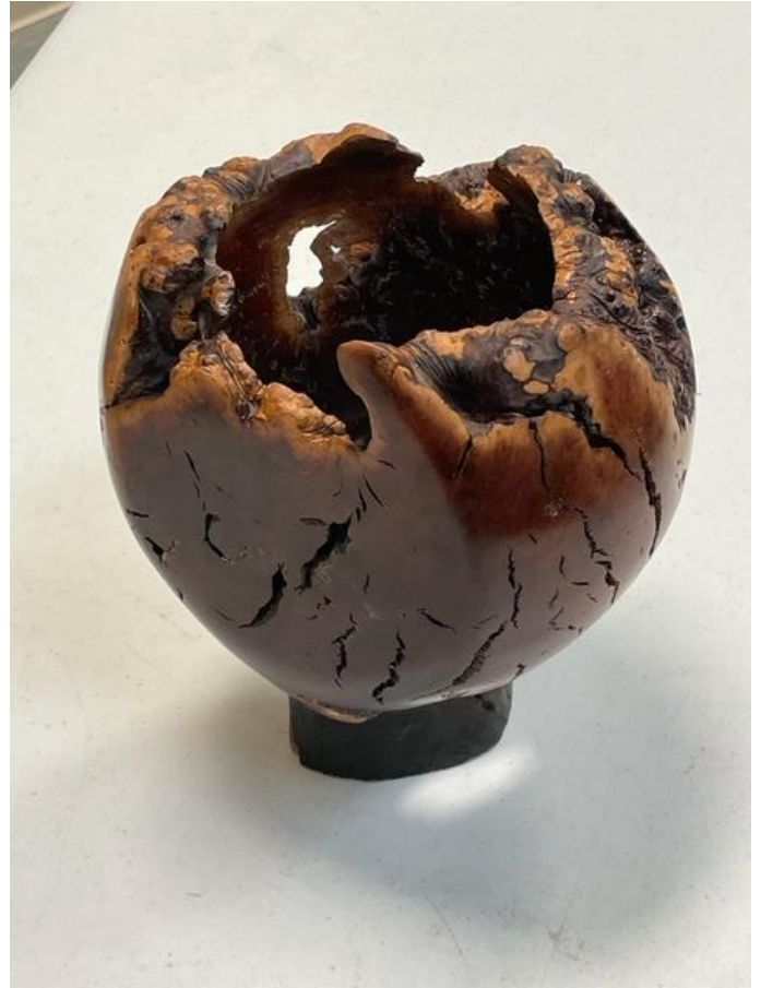
Burl vase from _____??