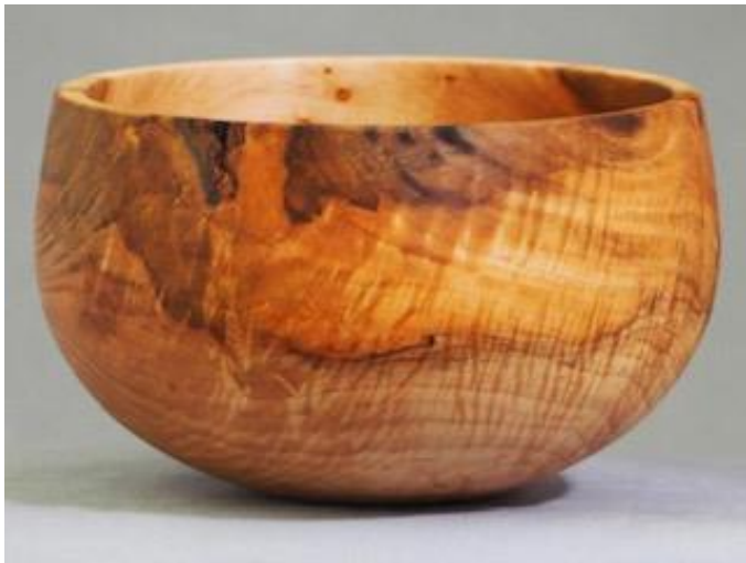
These are palewa and puahala umeke/calabashes, made from maple and spalted hickory. (Palewa are wider than they are tall and puahala are taller than they are wide). The maple calabash is 6 1/2 " at its widest, and finished with food grade mineral oil.