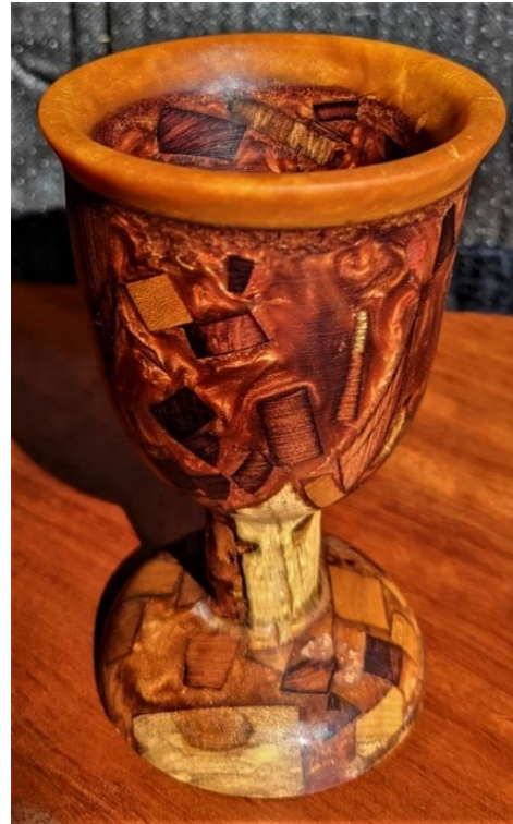
This is a chalice made from wild cherry and red wood chips in epoxy resin. It is 9" high and finished with friction polish.