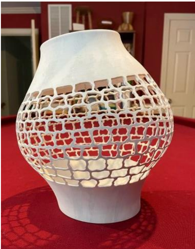
This is a pierced, multi-axis hollow form. It is made from bleached holly, with no finish. It is 8" dia. x 8 1/4" high.