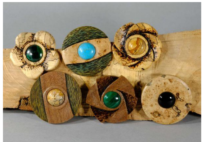
These are brooches I made from leftover wood. The stones are malachite, jasper, turquoise and black onyx. The stones were purchased at Craft Supplies. The finish is a water based urethane. My wife wore a couple at Chattanooga and they were very popular with the ladies there. I'll see how popular they are in Richmond, VA.