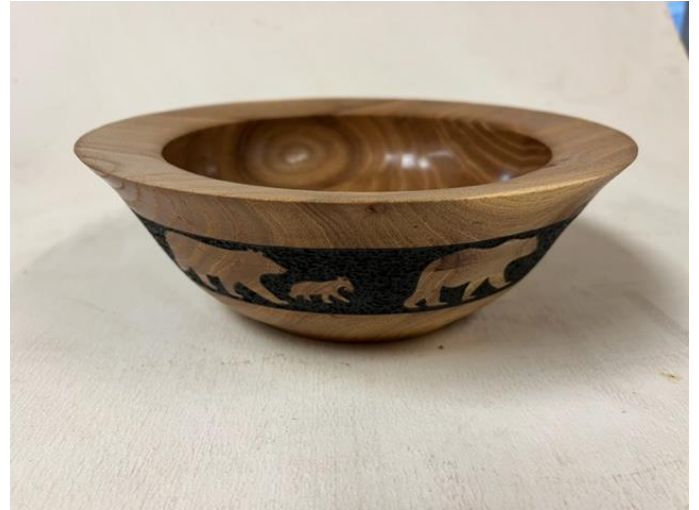
This is a Chinese elm bowl with bears and deer. It is 8 1/2" dia. x 3" high.