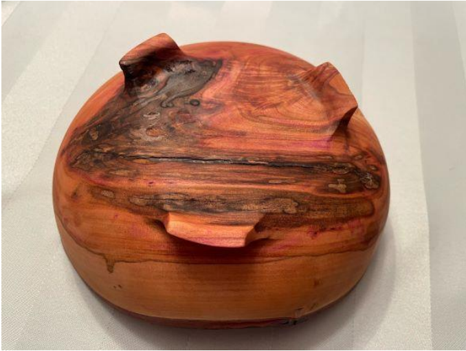
This is a bowl, made from plum. It is about 7" dia. x 3" high, finished with mineral oil.