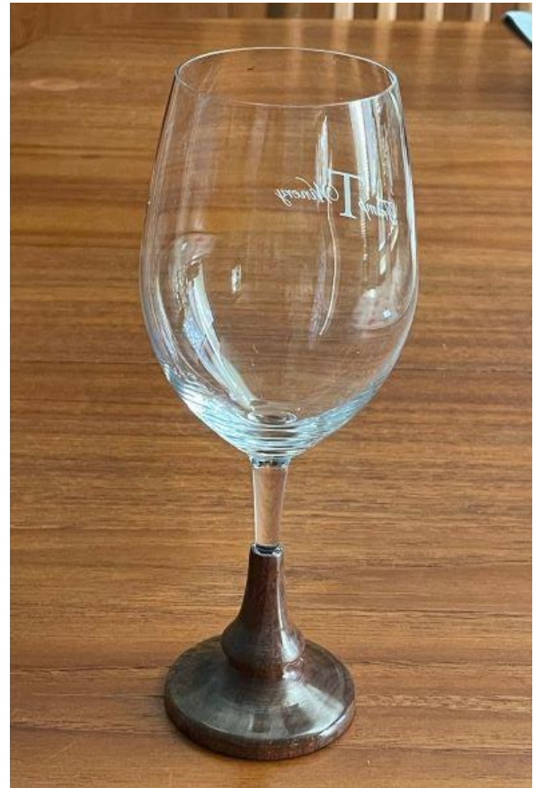
This is a broken stem wine glass that I salvaged some time ago. The base is walnut. The finish is most likely several coats of wipe on poly. I recommend E6000 glue, rather than CA for this application.