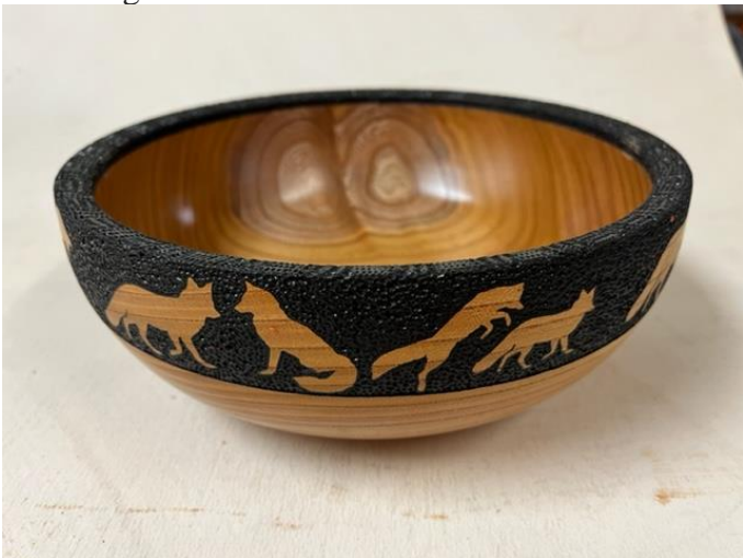
This a Chinese elm bowl with foxes. It is 9 1/2" dia. x 4" high.