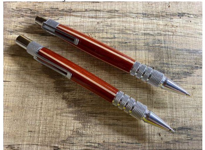
These are made with redheart, with a CA glue finish.