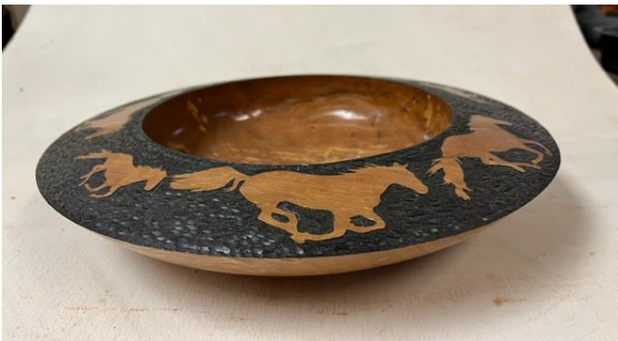
This is a cherry bowl with horses. It is 12 1/2" dia. x 2.5" high.